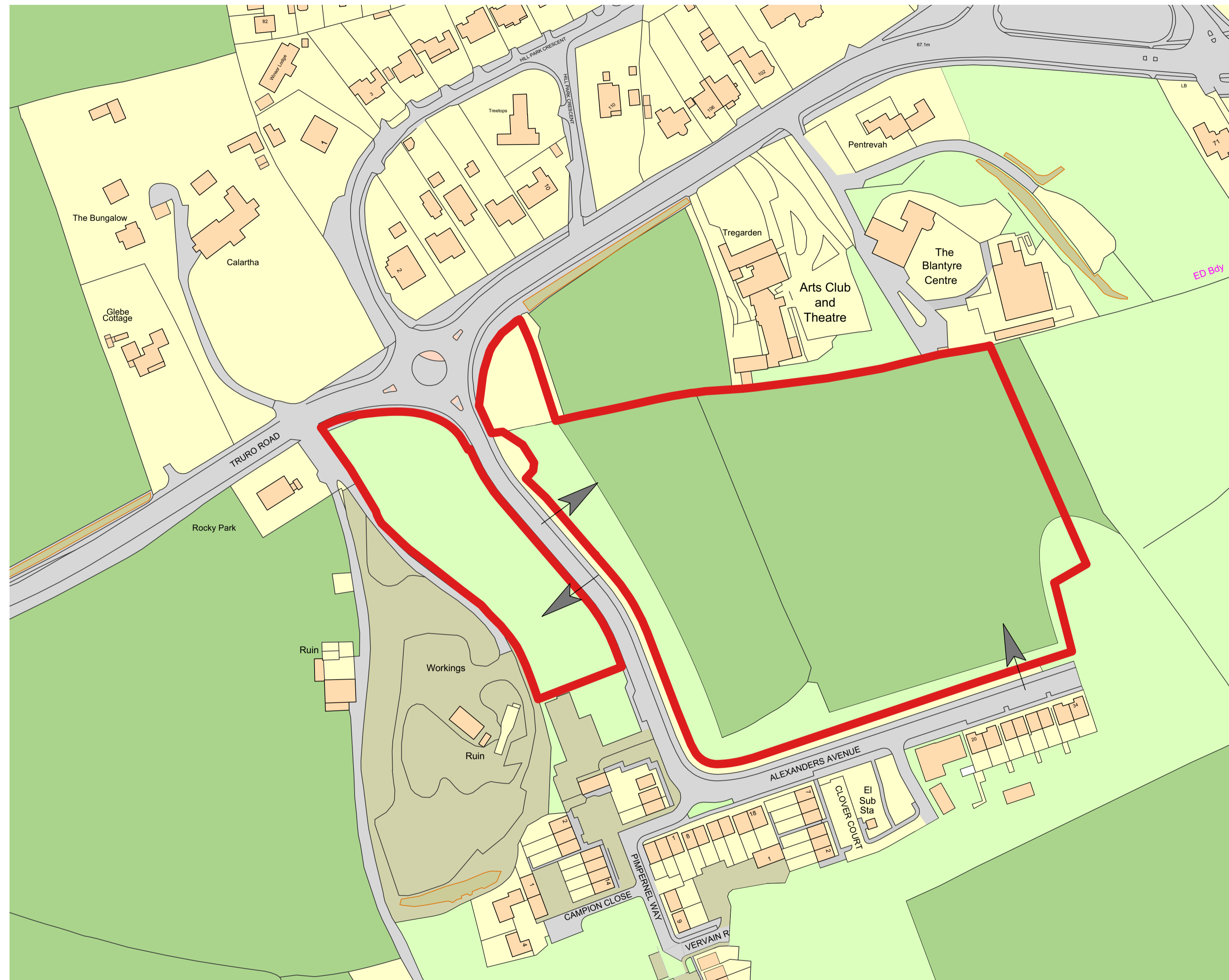
1 OS Site Location Plan Scale: 1:1250