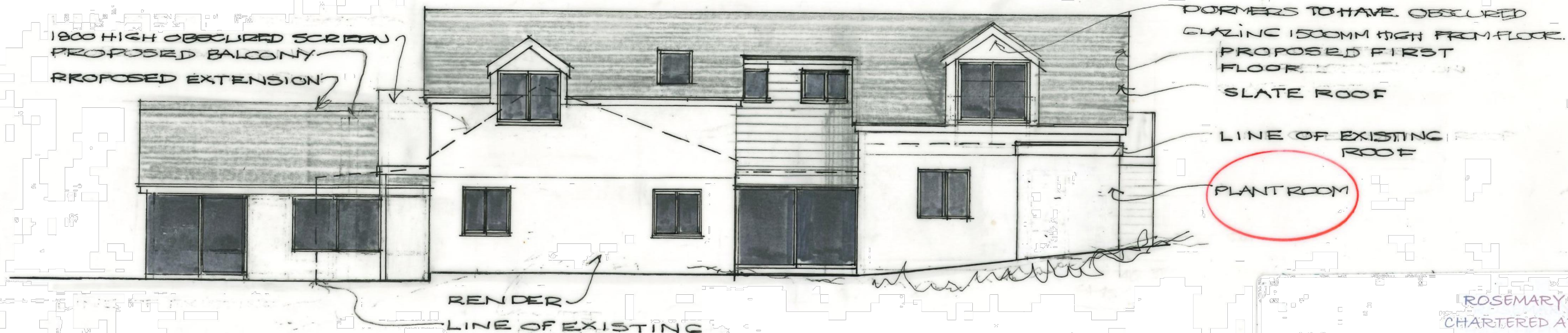
SW Elevation 1:100 @ A3

1800 HIGH OBSCURED SCREEN PROPOSED BALCONY PROPOSED EXTENSION