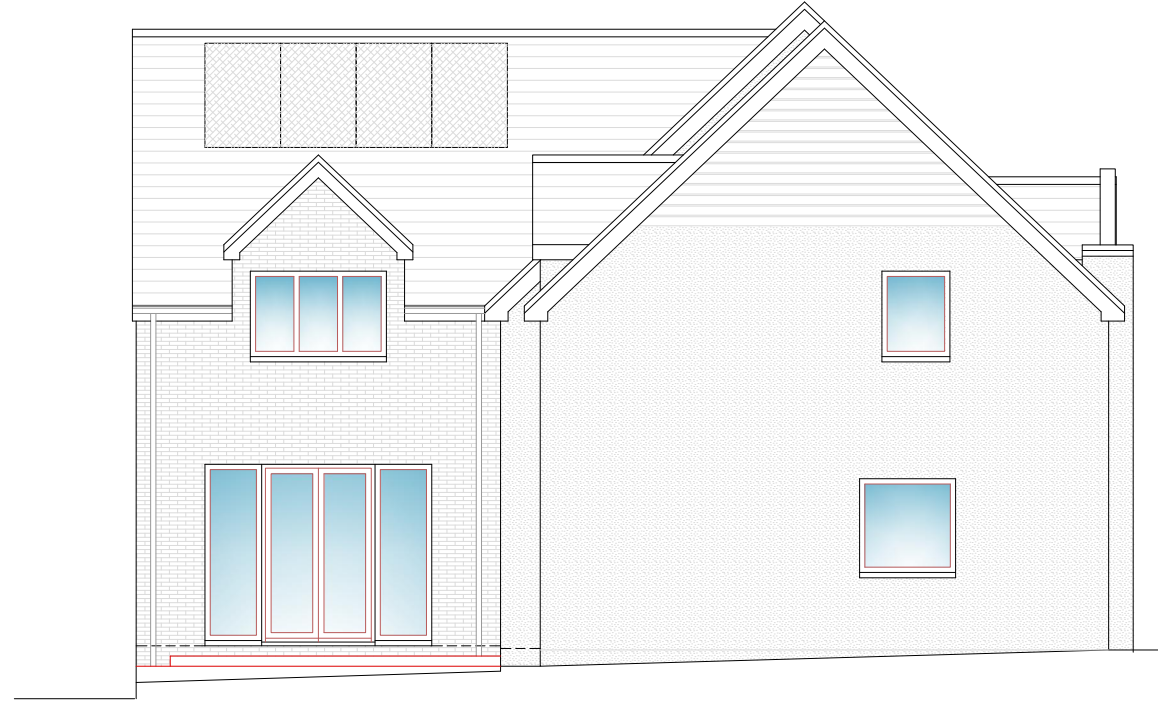
PROPOSED EAST (REAR) ELEVATION 1:100 @ A3

— FIRST CEILING — FIRST FLOOR — GROUND CEILING — GROUND FLOOR