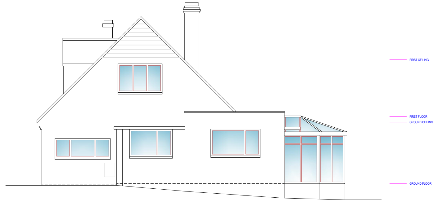
EXISTING WEST (FRONT) ELEVATION 1:100 @ A3