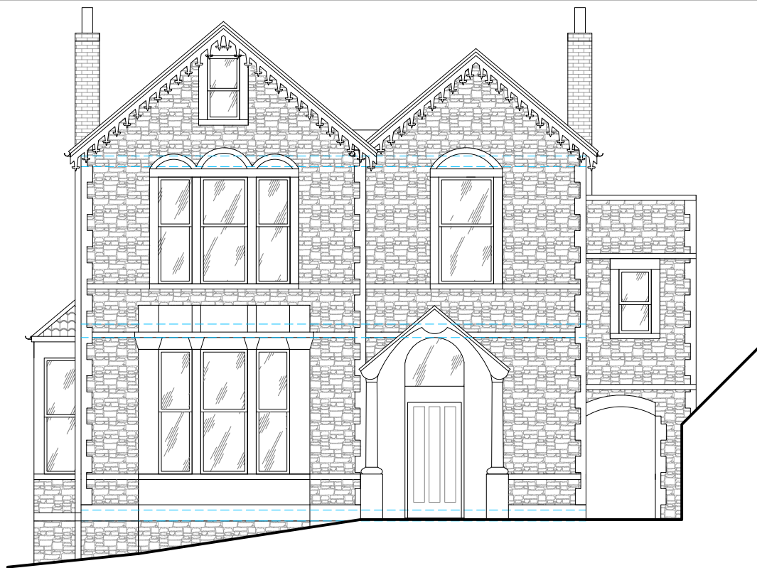
EXISTING FRONT (SOUTH EAST) ELEVATION