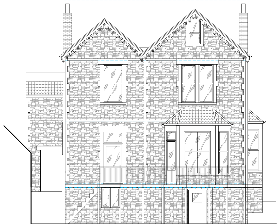
EXISTING REAR (NORTH WEST) ELEVATION