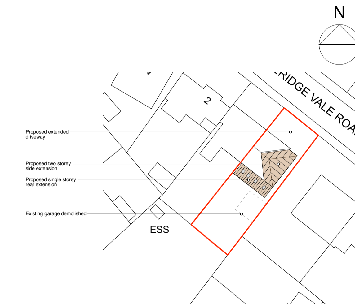
PROPOSED SITE LAYOUT PLAN 1:500