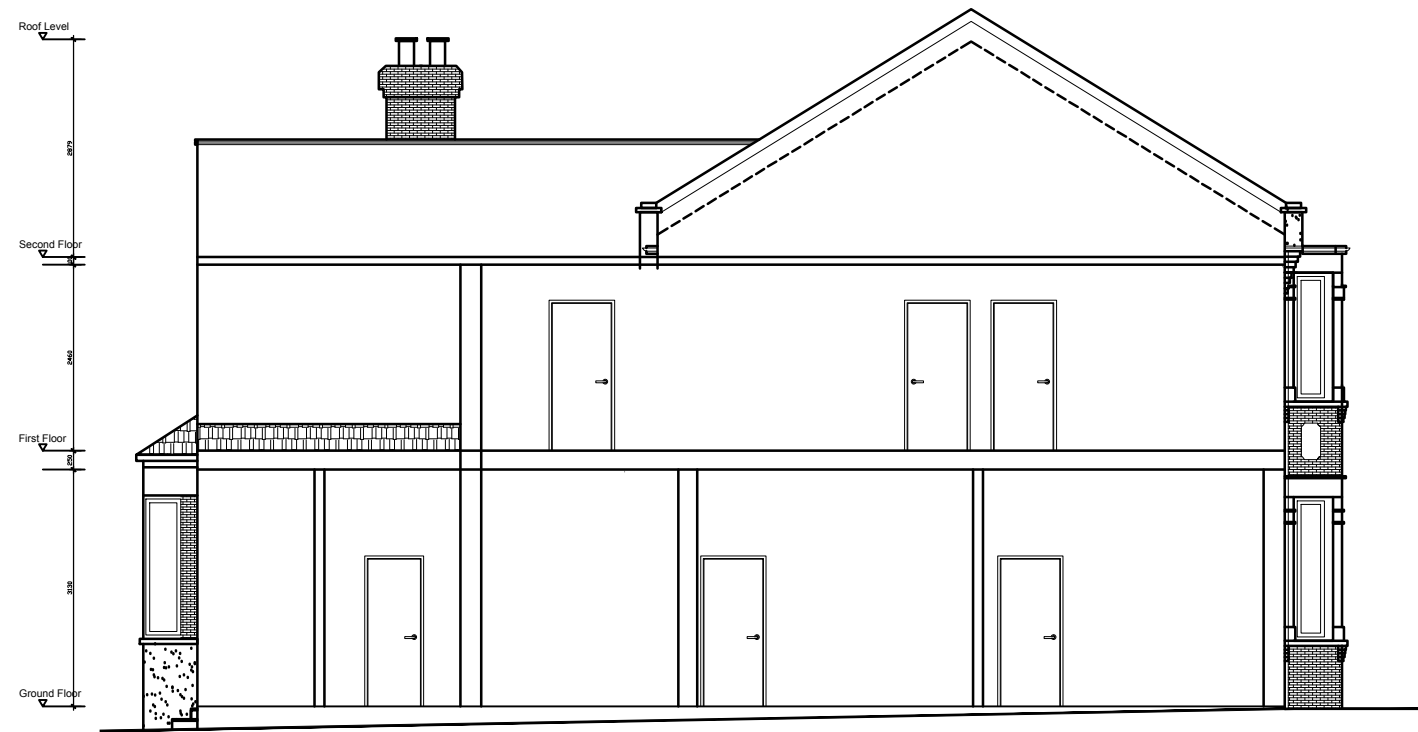
Existing Section AA