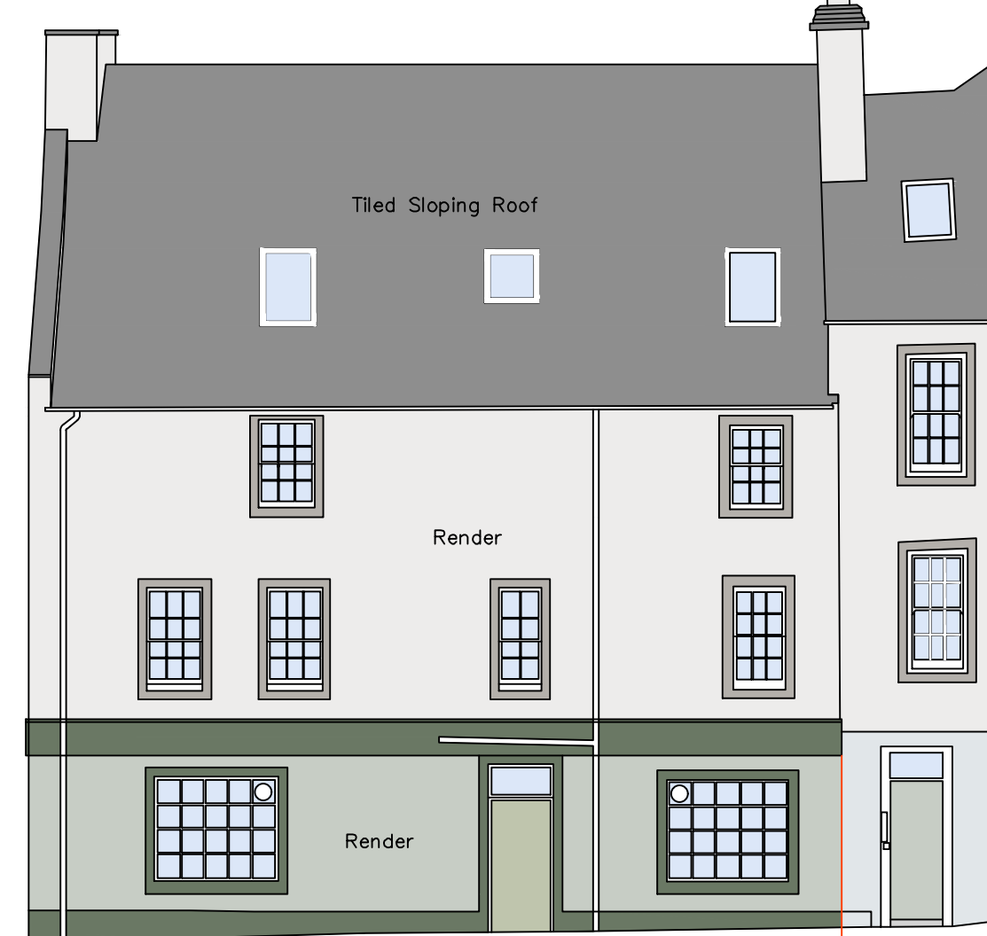
EAST ELEVATION - WATERGATE