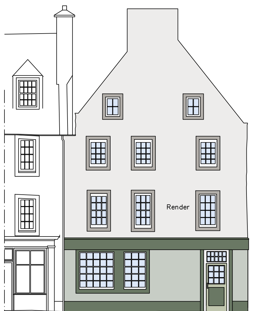
SOUTH ELEVATION - 7 SOUTH STREET