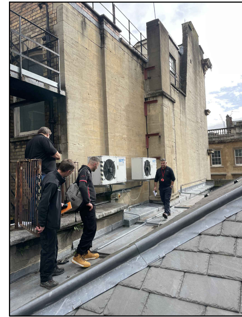
LOCATION OF EXISTING CONDENSERS. NEW CONDENSER TO BE INSTALLED UNDERNEATH ON BIG FOOT SUPPORT SYSTEM