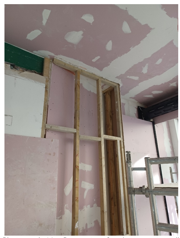
Photograph 16 – Preparatory framing to party wall