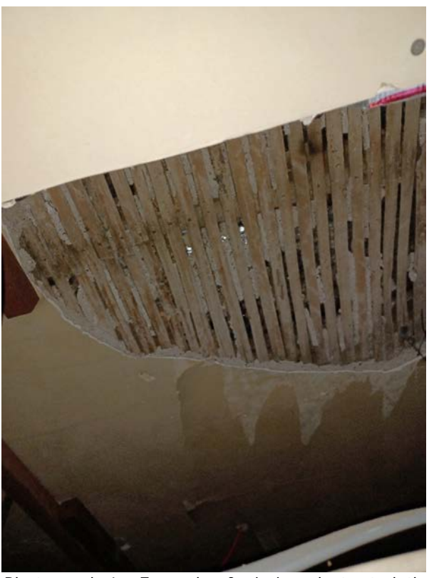
Photograph 4 – Example of missing plaster to lath and plaster ceiling over main retail space