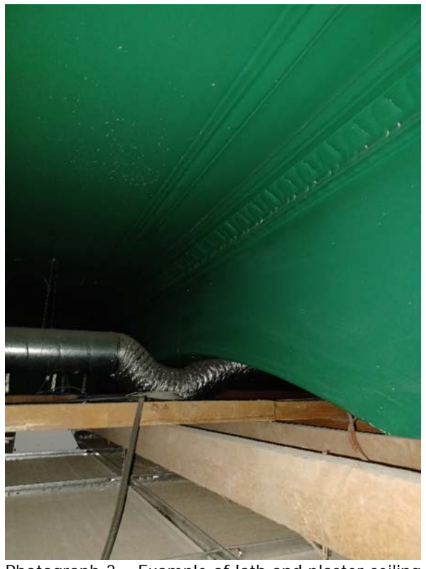
Photograph 3 – Example of lath and plaster ceiling over main retail space