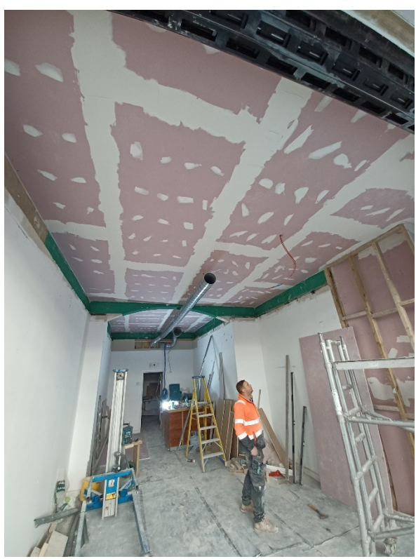
Photograph 15 – Fire board installed to new subframe