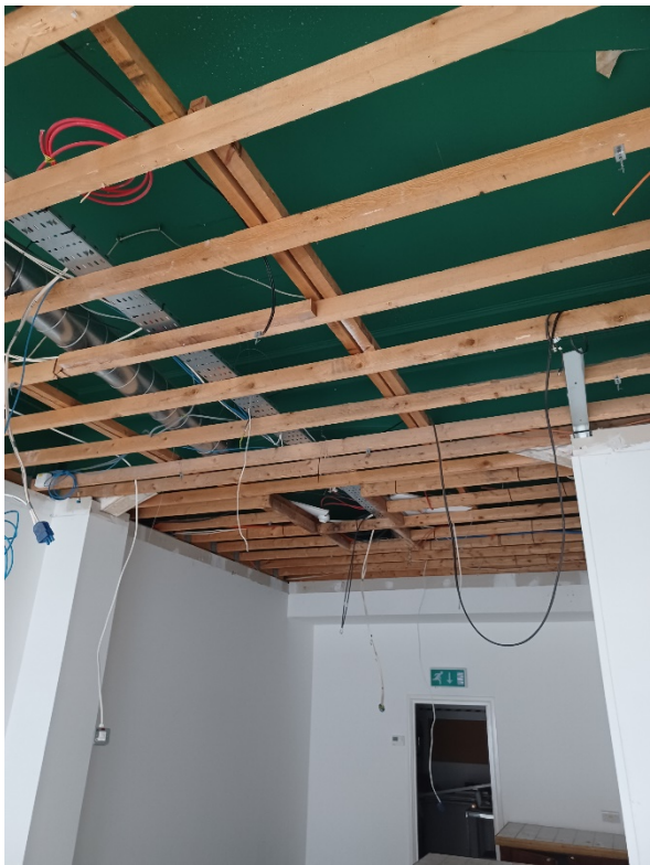
Photograph 8 – General view of sub-frame