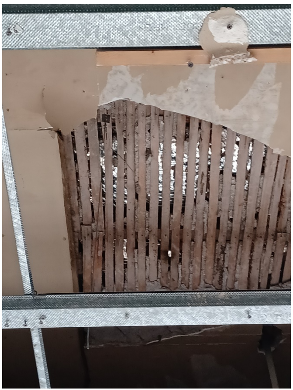
Photograph 7 – Area of failed plaster