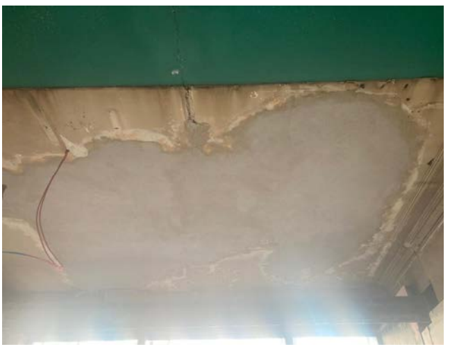
Photograph 13 – Completed plaster repairs