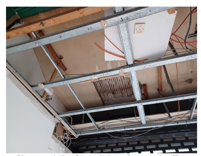
Photograph 5 – General view of exposed soffit