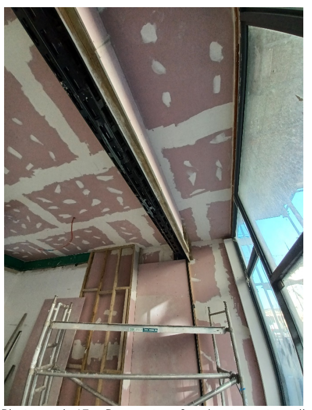
Photograph 17 – Preparatory framing to party wall