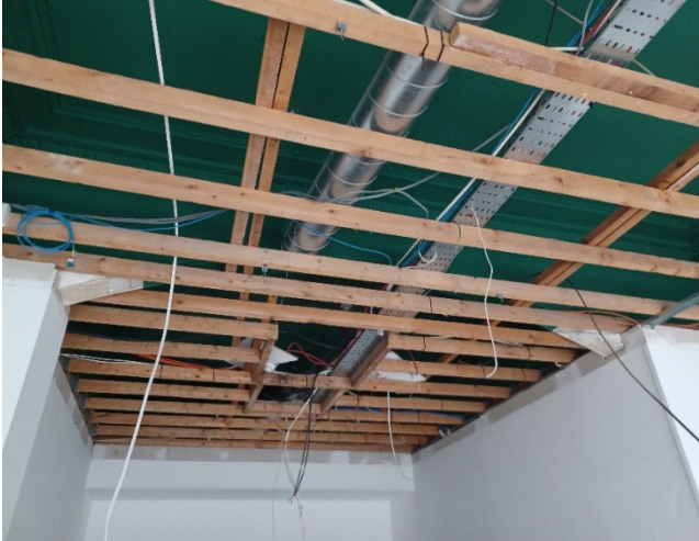
Photograph 6 – Previously installed timber subframe