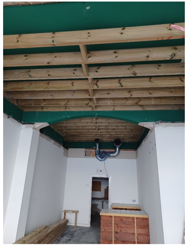
Photograph 14 – General view of new independent sub-frame