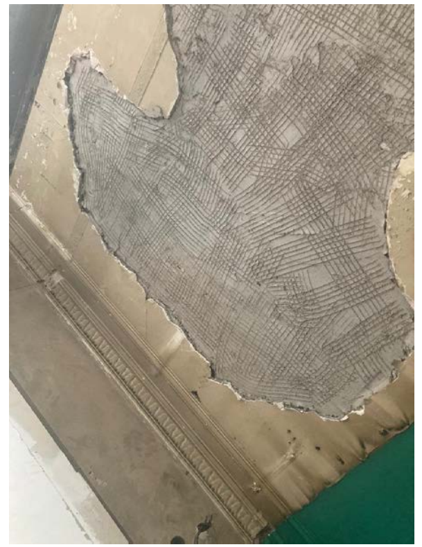
Photograph 10 – First coat plaster repairs