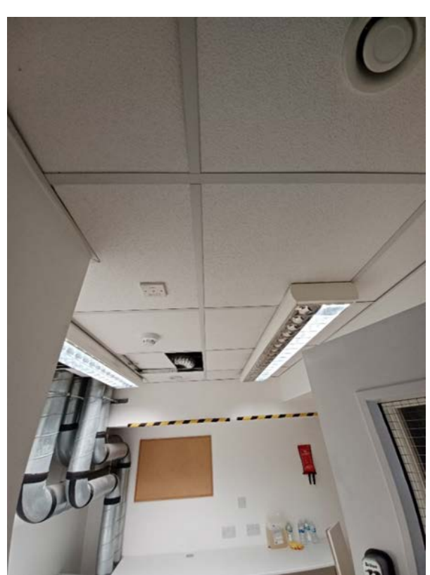
Photograph 2 – Rear Store Area (Suspended Ceiling)