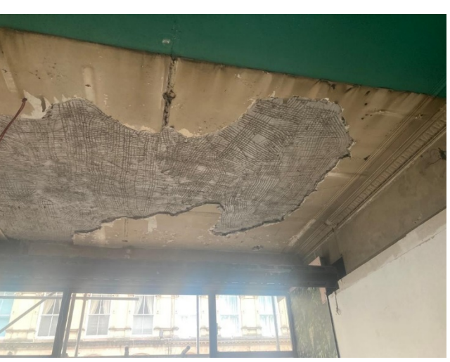
Photograph 11 – First coat plaster repairs