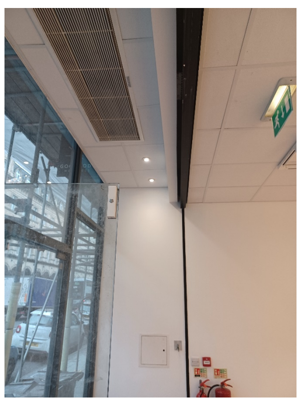
Photograph 19 – Shopfront area post reinstatement of suspended ceiling