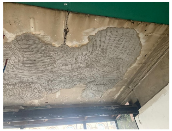
Photograph 12 – Second coat plaster repairs