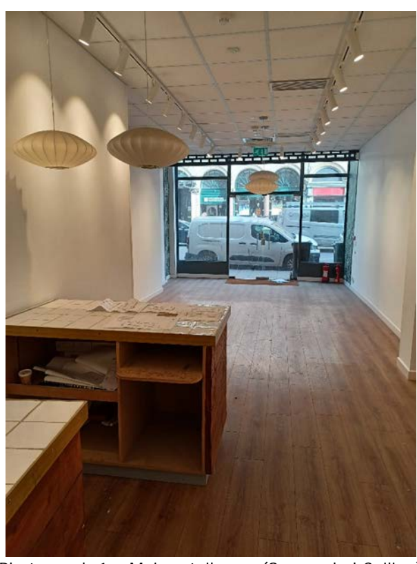
Photograph 1 – Main retail area (Suspended Ceiling)