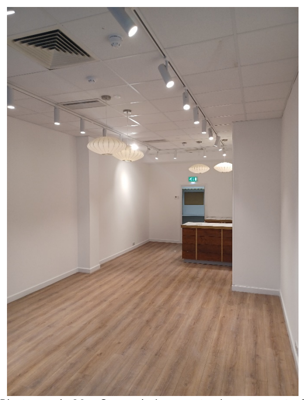
Photograph 20 - General view post reinstatement of suspended ceiling