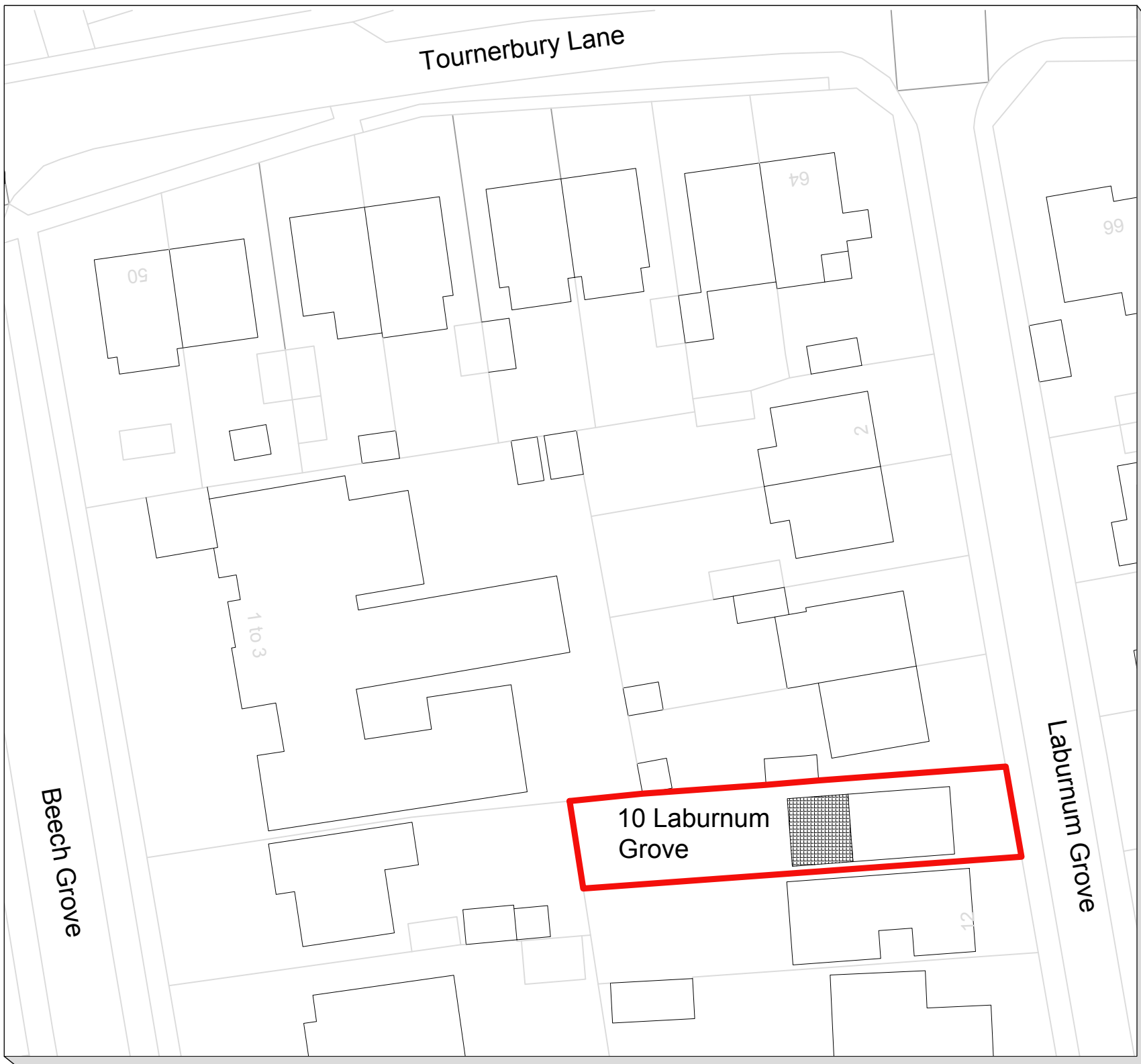
block plan (proposed) 1:500 @ A3