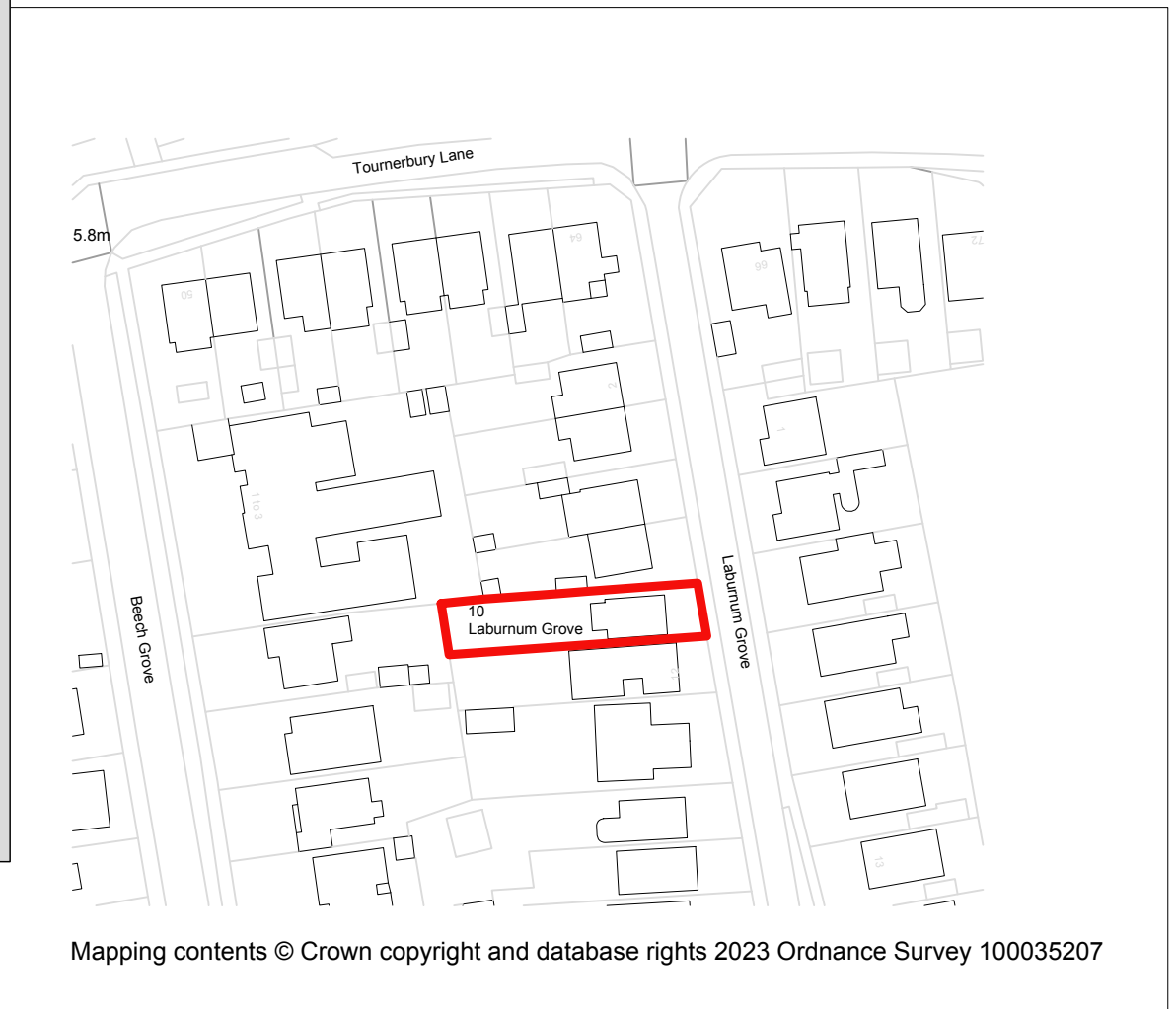
location plan (existing) 1:1250 @ A3