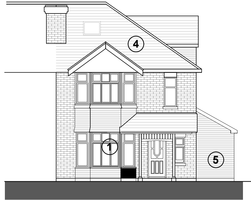
PROPOSED SOUTH (FRONT) ELEVATION SCALE 1:100

Construction Design and Management (CDM) REGULATIONS 2015, RISK ASSESSMENT. M & E Standards required - CIBSE, BAFE, NICEIC, Gas safe. Dampers to ducting where required. Fire stopping where required. Light fittings to be Fire Rated where ceilings are fire separation. Fire Officer Testing and Certificate. BUILDING REGULATIONS To Building regulation and British Standard. Requirements in all respects. To Fire Officer requirements in all respects. The Building Contractor must include for all works required by the M&E Contractors.