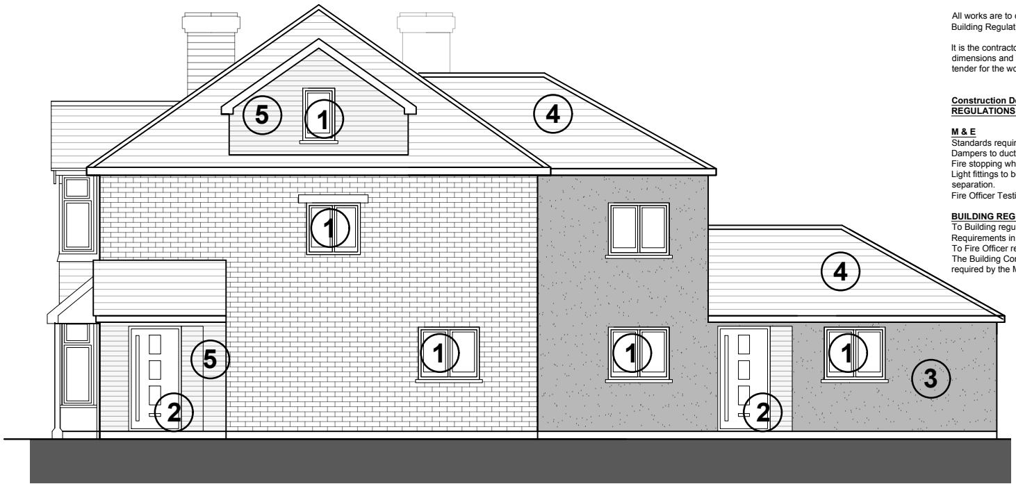
PROPOSED EAST (SIDE) ELEVATION SCALE 1:100