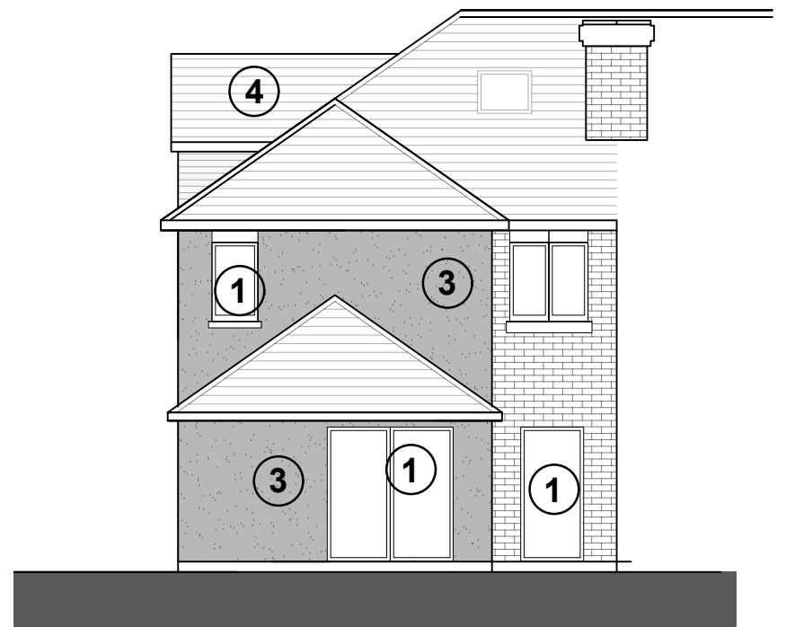
PROPOSED NORTH (REAR) ELEVATION SCALE 1:100