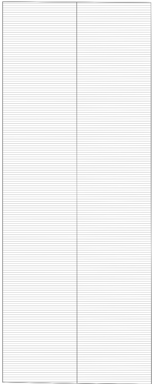
Proposed Roof Plan 1 : 100