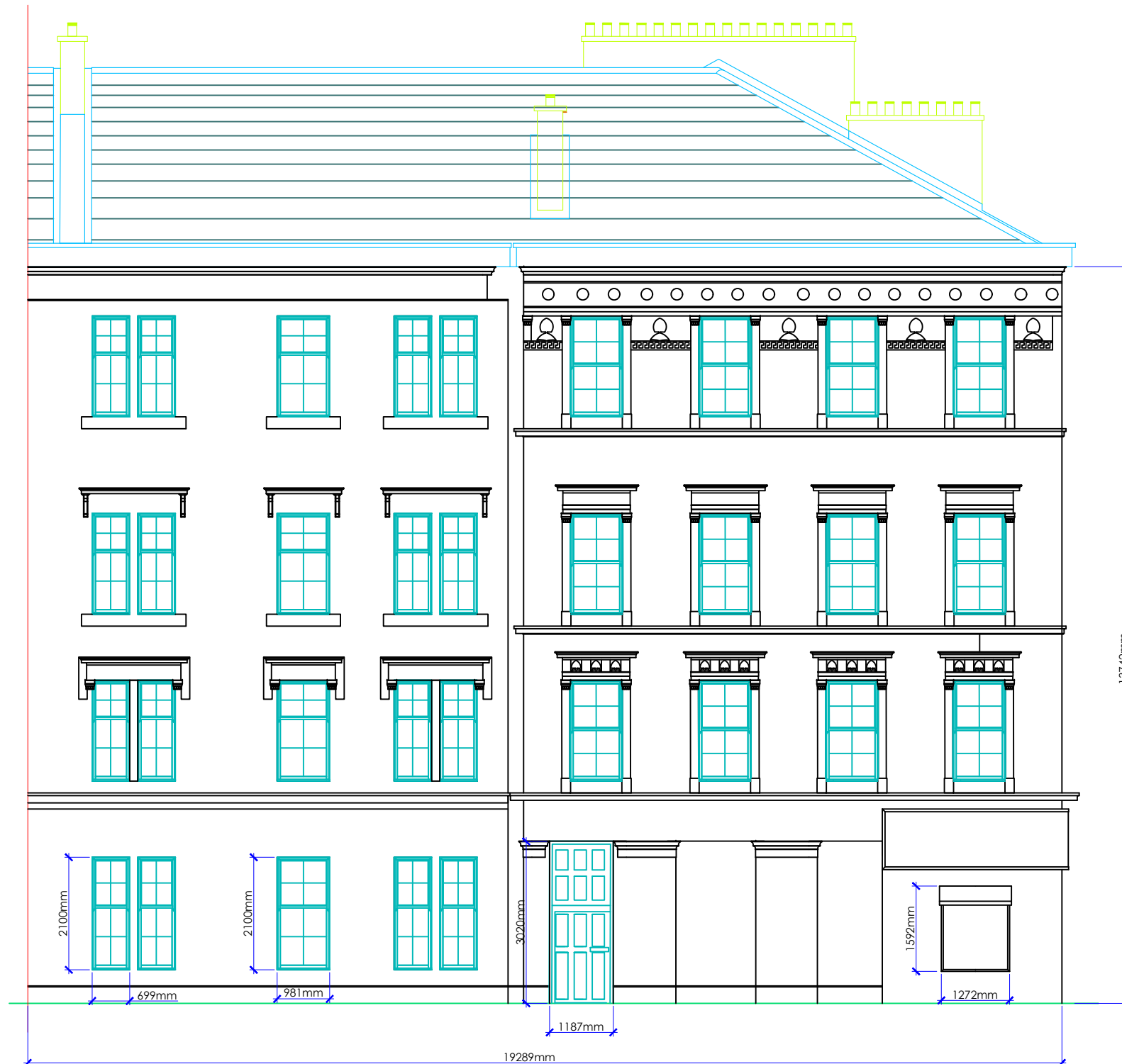
GARTURK STREET (Front Elevation)