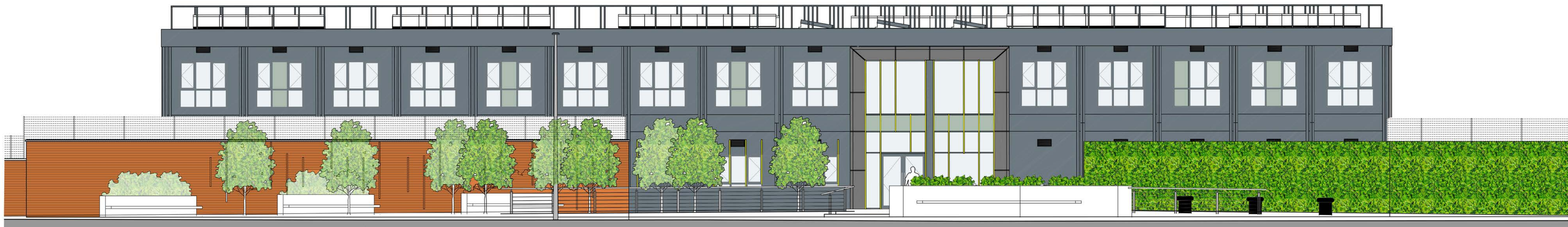
Elevation From South Street 1:100