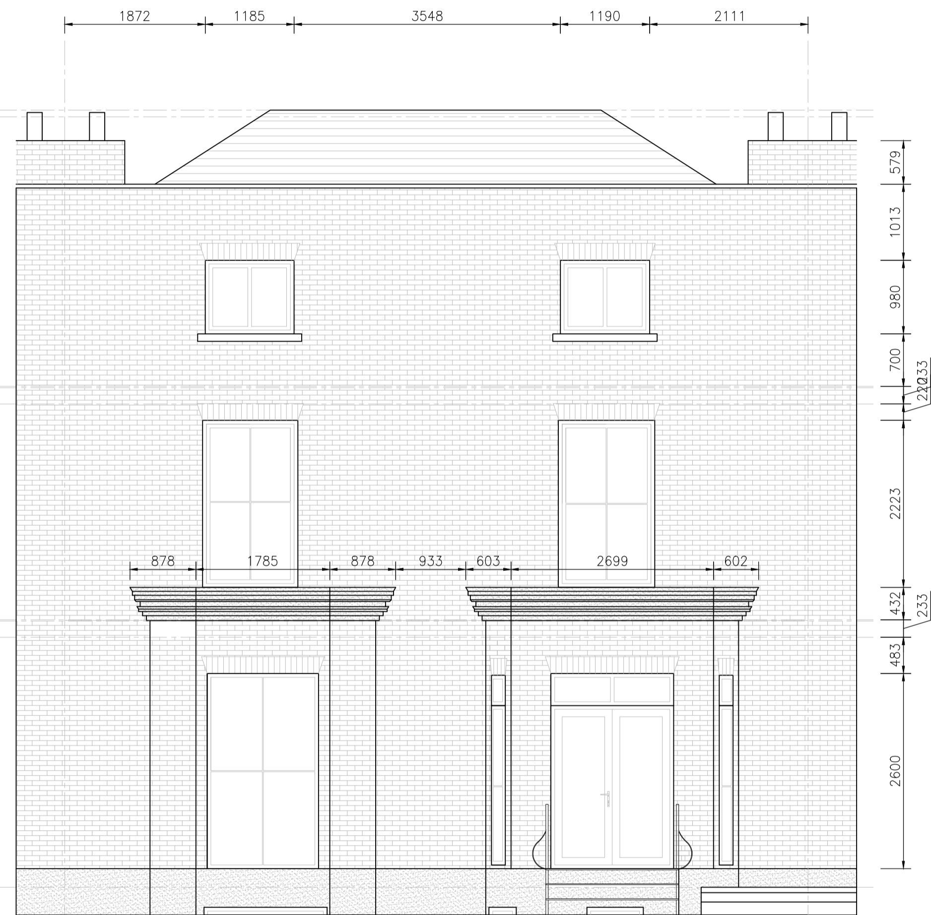
EXISTING REAR (SOUTH) ELEVATION 1:50@A1