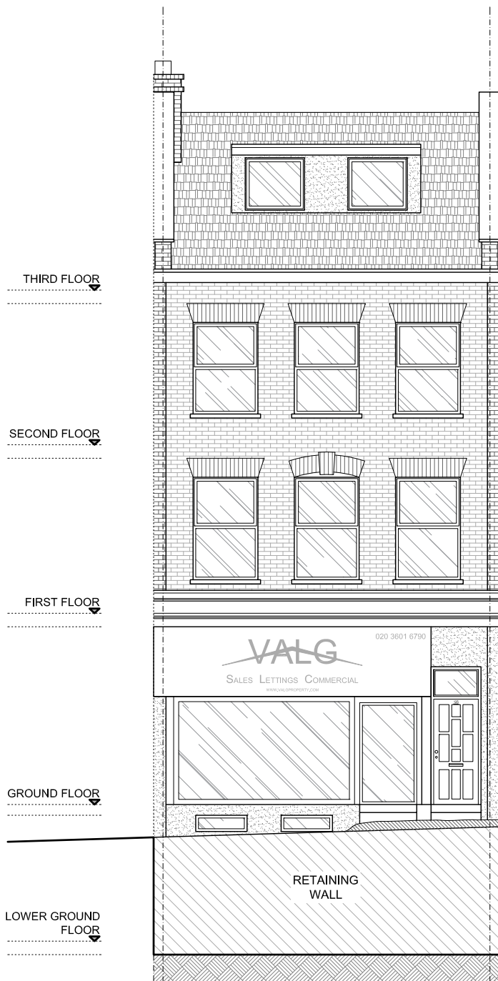
EXISTING GROUND FLOOR