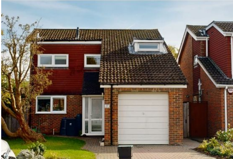
Front view and Driveway