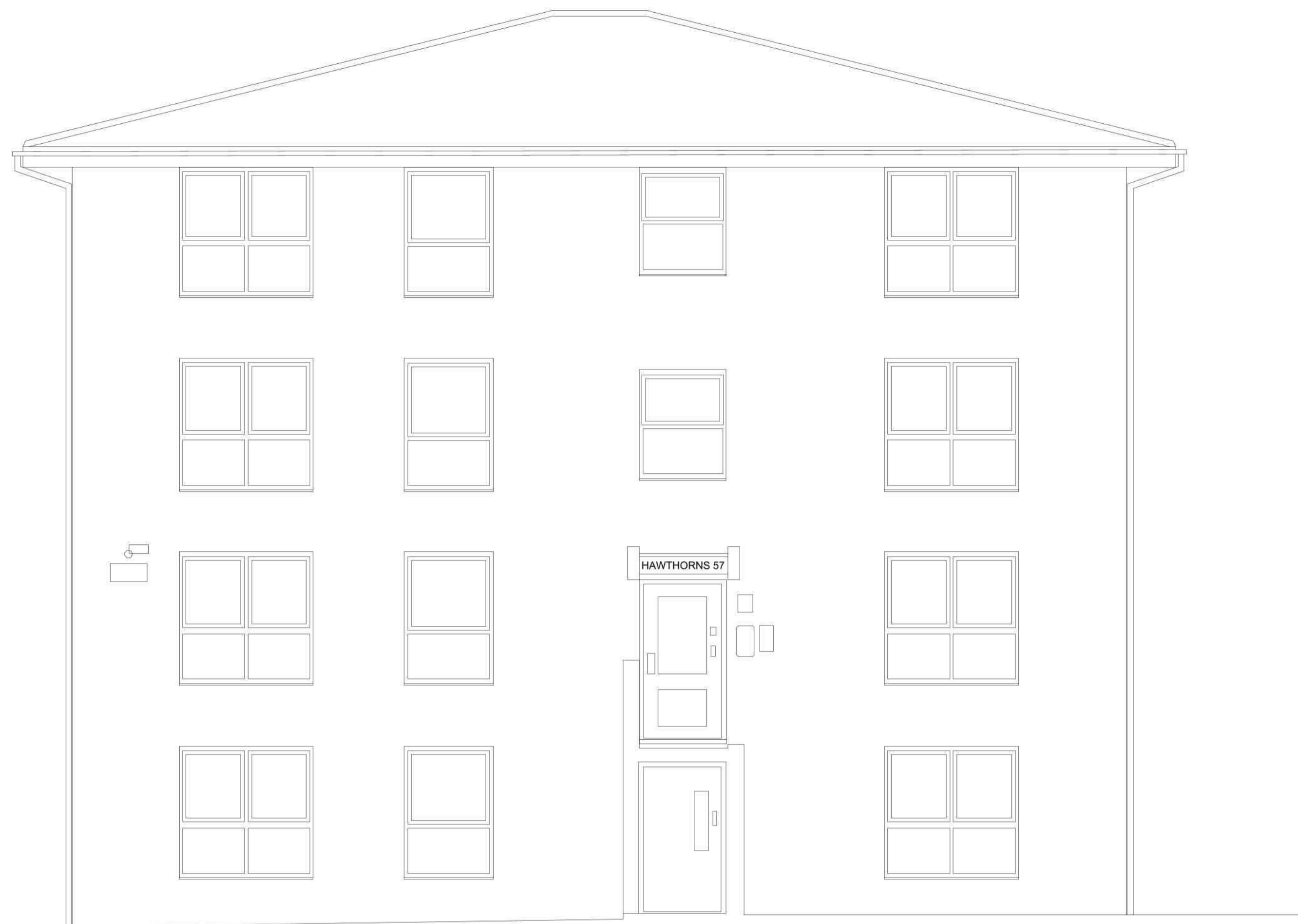
THE HAWTHORNS EXISTING FRONT ELEVATION