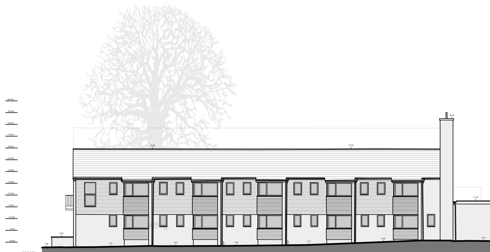
East Wing - East Elevation