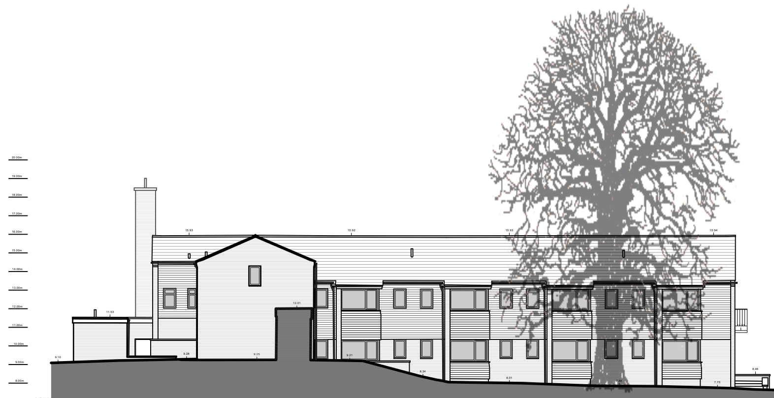
East Wing - West Elevation (courtyard)