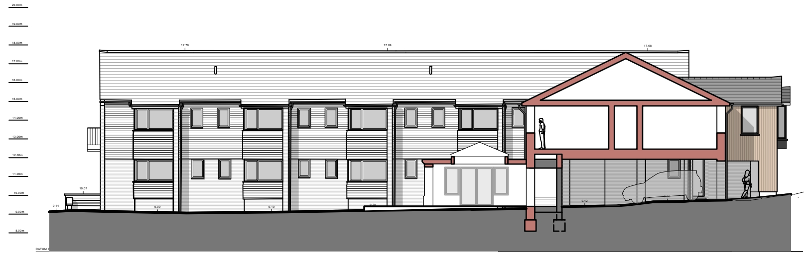
West Wing - East Elevation (courtyard)

Array of solar photovoltaic panels on existing western roof slope of west wing and eastern roof slope of east wing. Exact number and position to be confirmed following appointment of mechanical engineer post-planning.