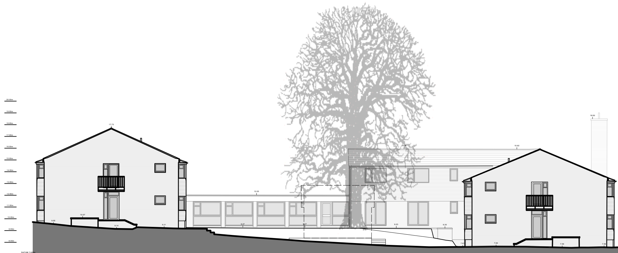
South Elevation (towards Farnham Road)