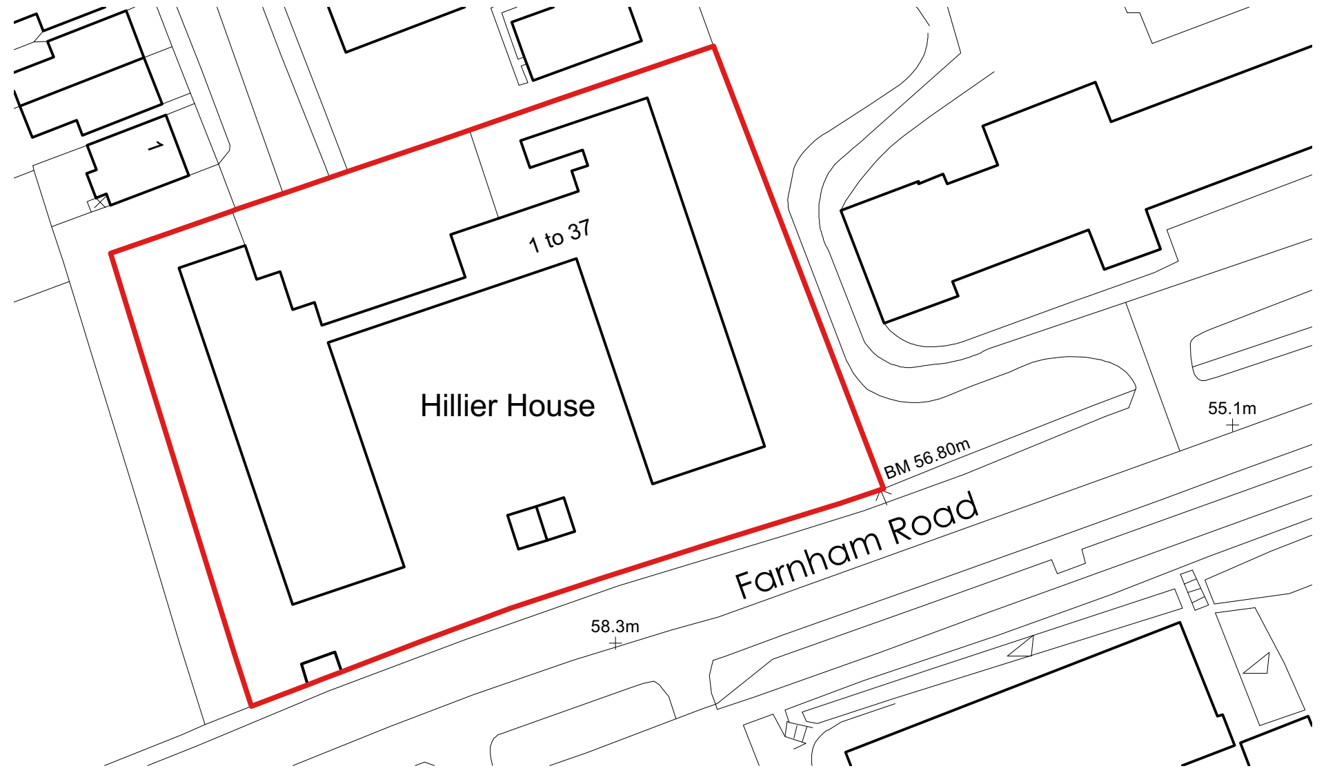
BLOCK PLAN scale at 1:500 @A3