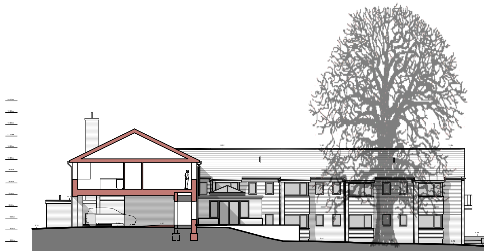
East Wing - West Elevation (courtyard)