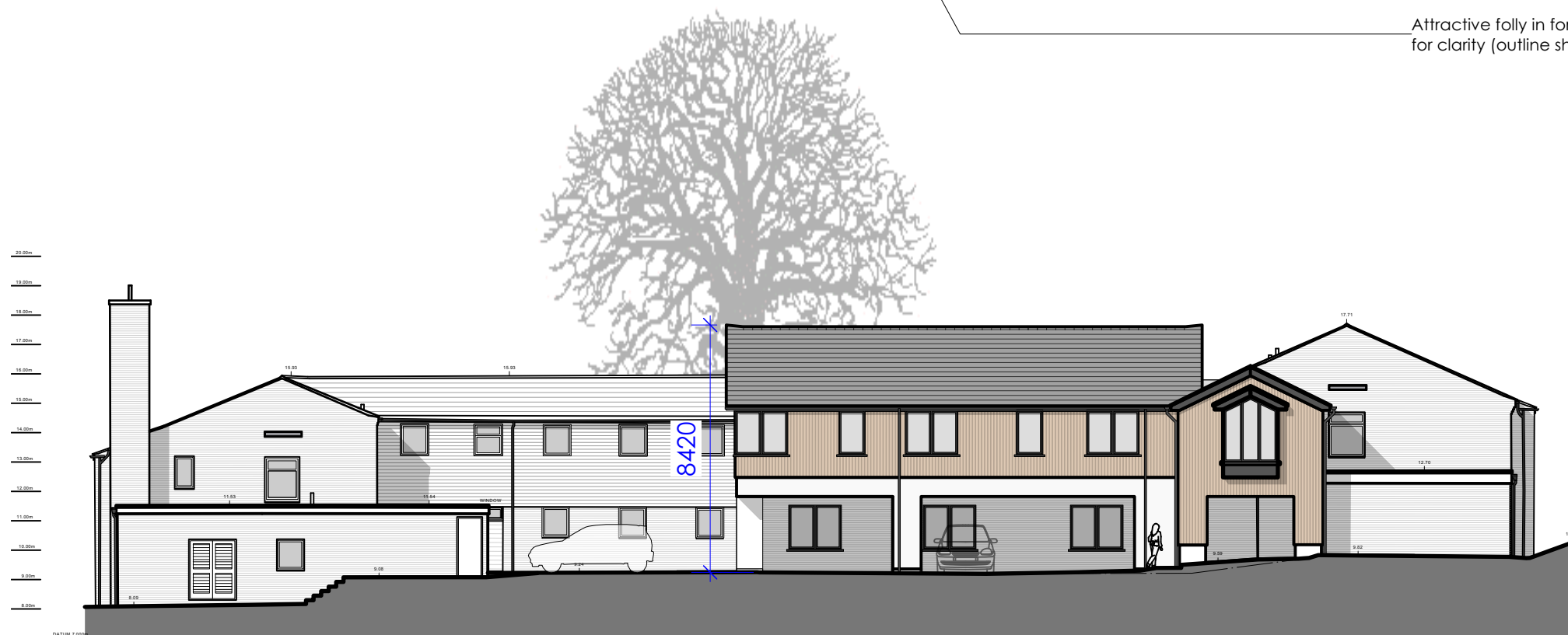
North Elevation (towards Bray Road)

Attractive folly in foreground omitted for clarity (outline shown dotted).