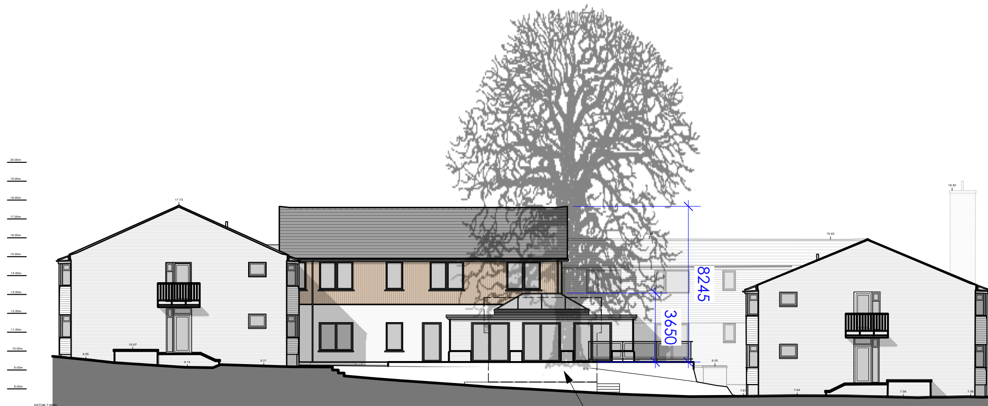
South Elevation (towards Farnham Road)

Attractive folly in foreground omitted for clarity (outline shown dotted).