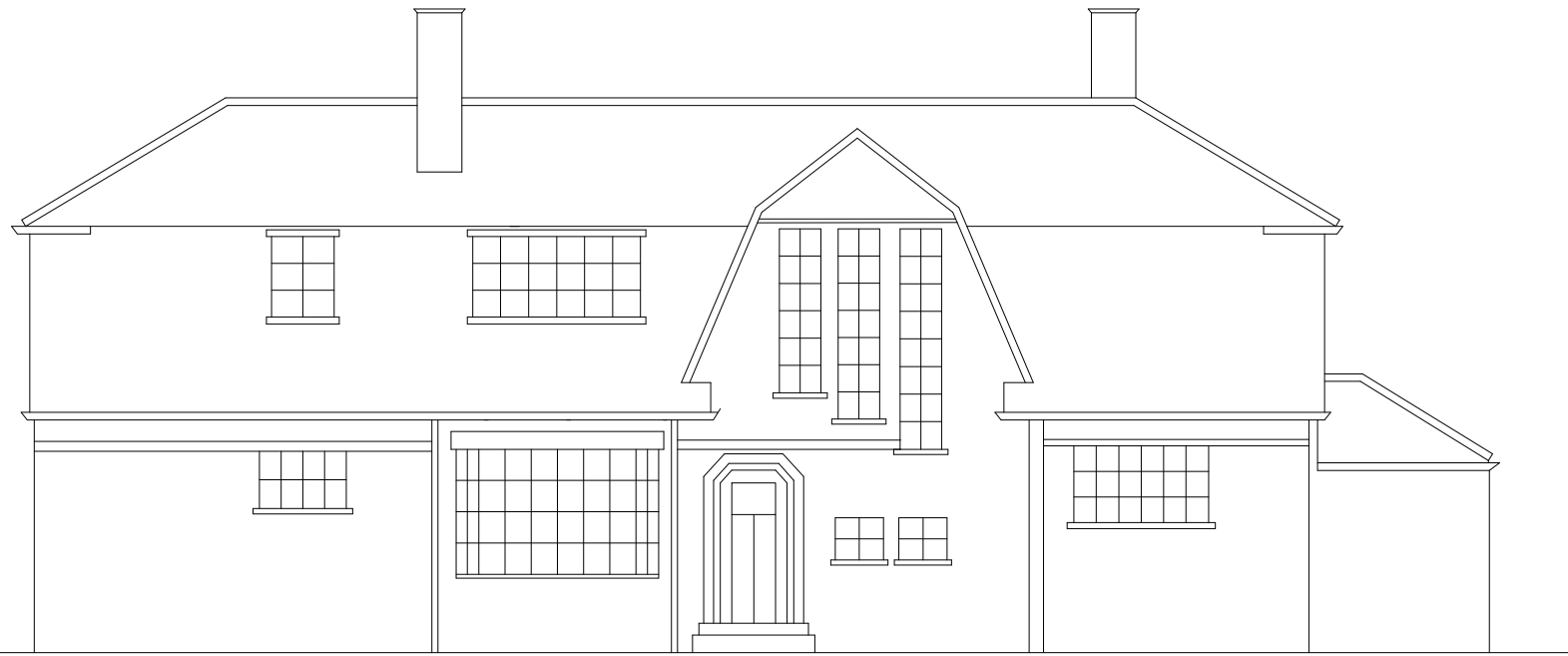
Proposed North East Elevation ( No change to existing )