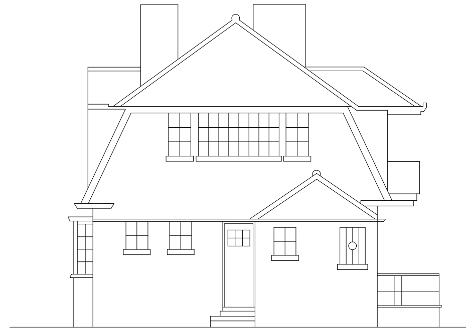
Proposed North West Elevation ( No change to existing )