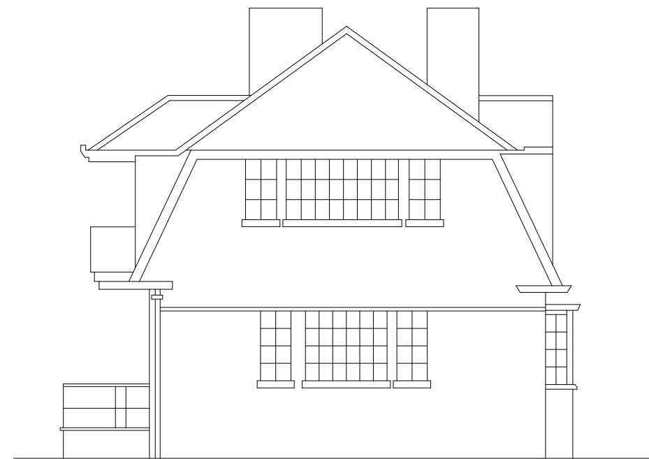
Proposed South East Elevation ( No change to existing )