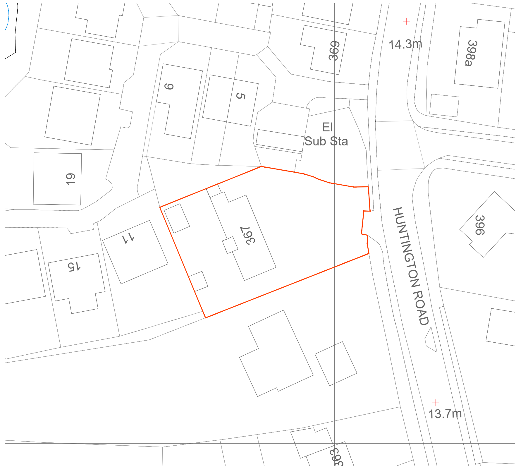
Block Plan 1:500 At A3