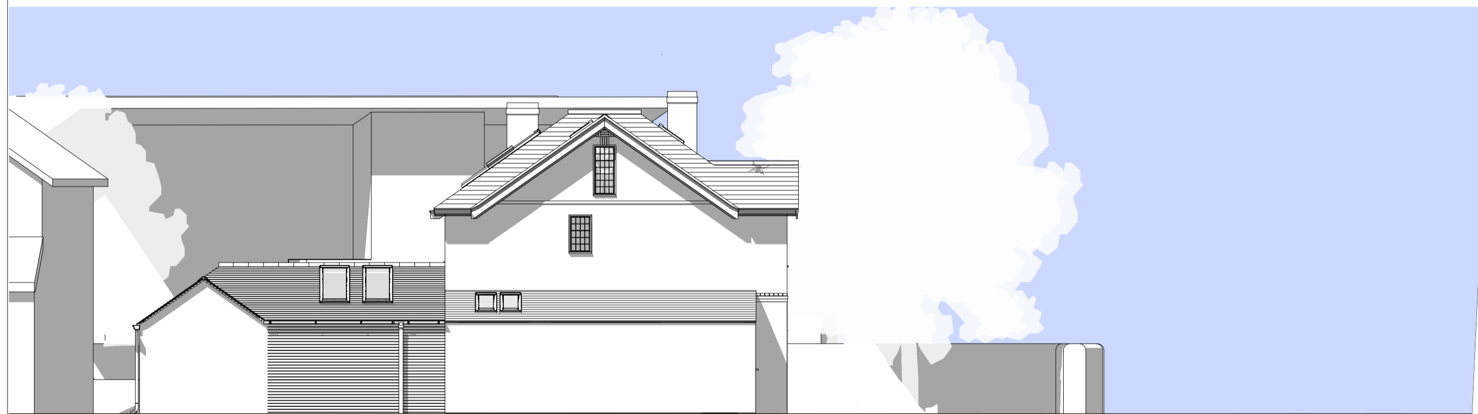
Side (Eastern) Elevation