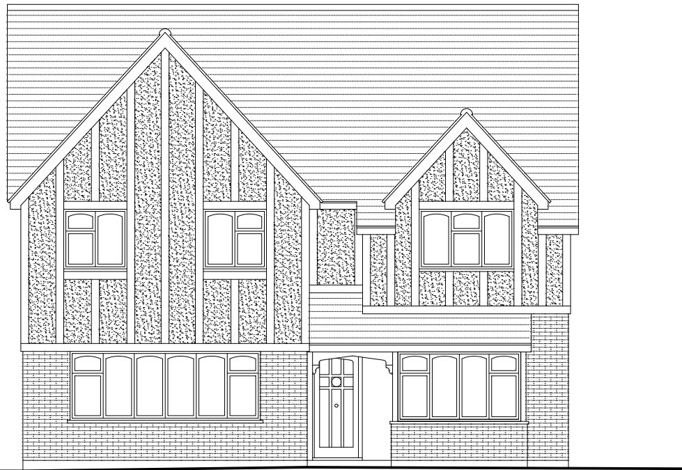
FRONT ELEVATION (Faces South) (NO CHANGE)