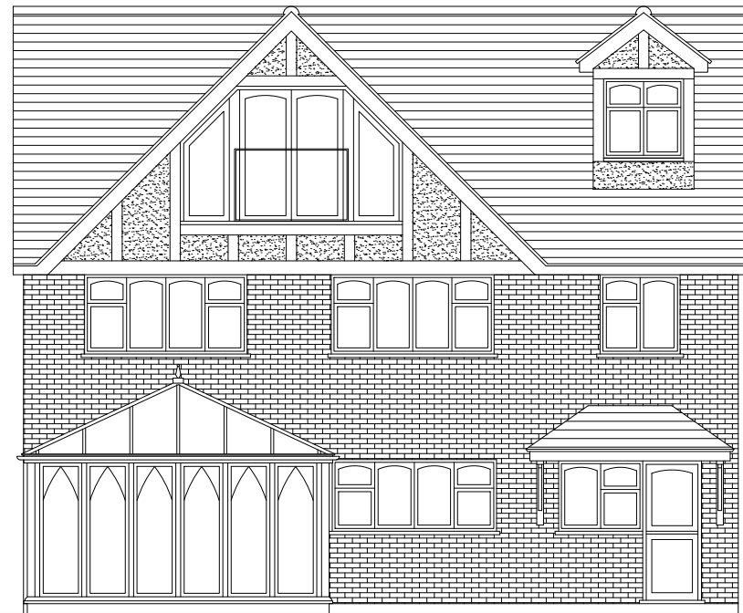
REAR ELEVATION (Faces North)