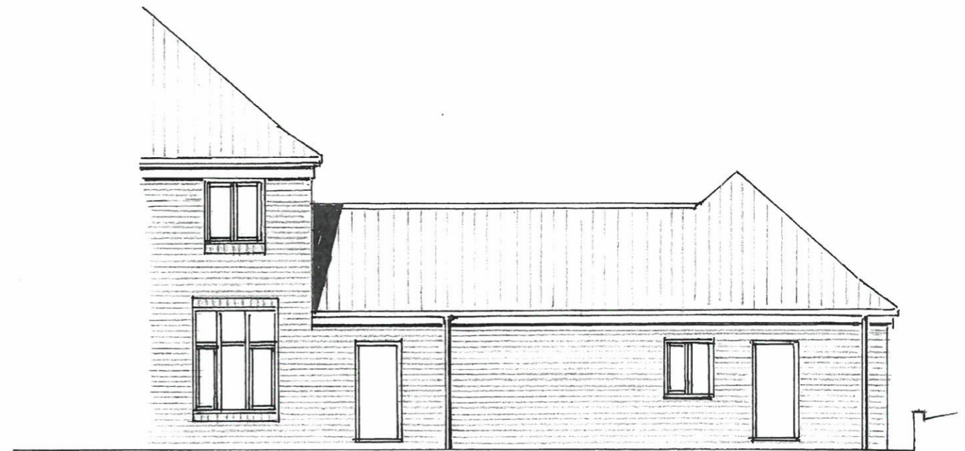
existing north elevation