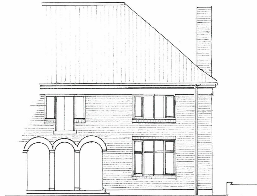
existing front elevation 1/100