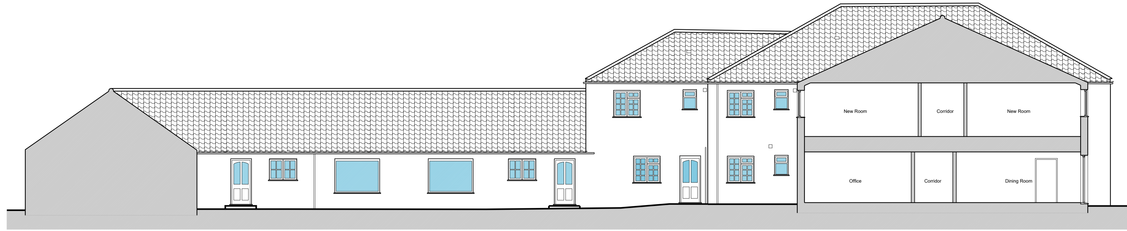
Existing Courtyard North Sectional Elevation