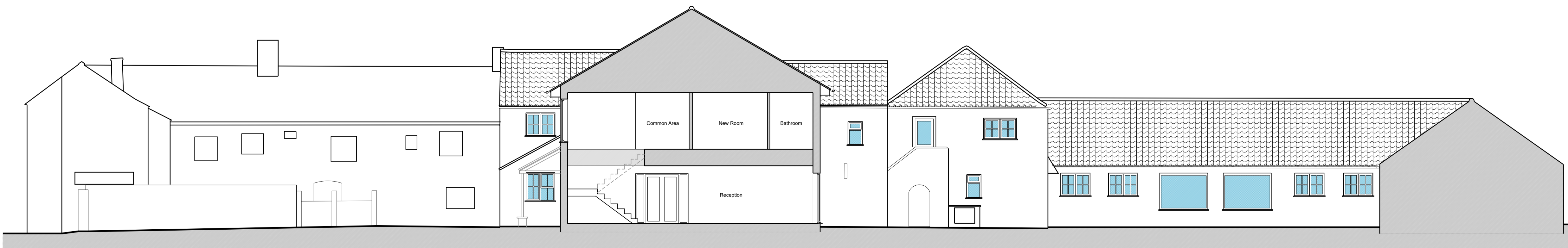
Existing Courtyard West Sectional Elevation

Amendments: a) 14.11.23 - Amended to updated survey and added porch b) 15.11.23 - Roof amended, porch added to east elevation c) 16.11.23 - Sections amended