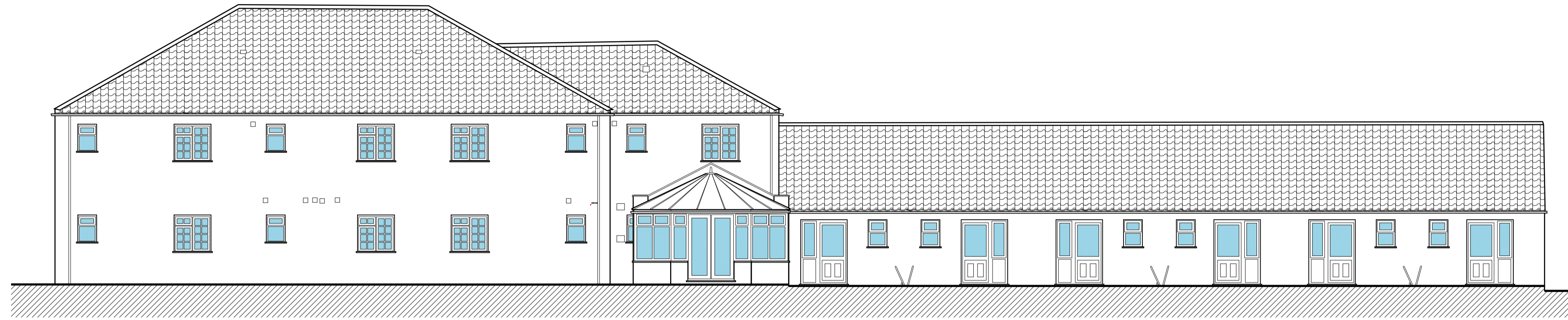
Elevation Existing South