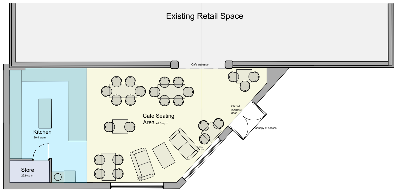
Proposed ground floor plan