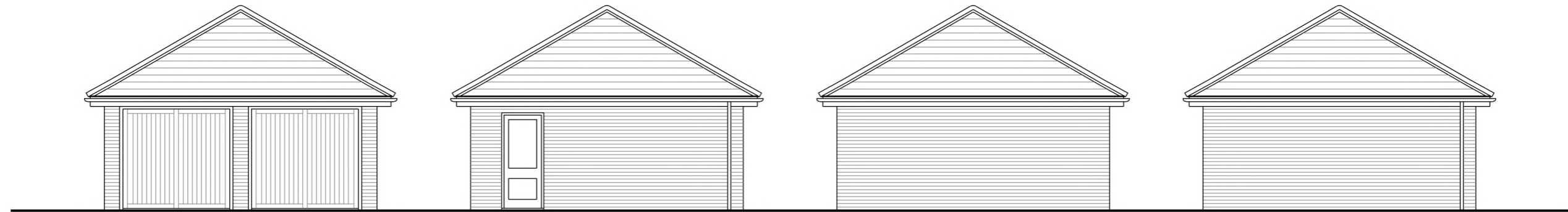
Front Elevation 1:100