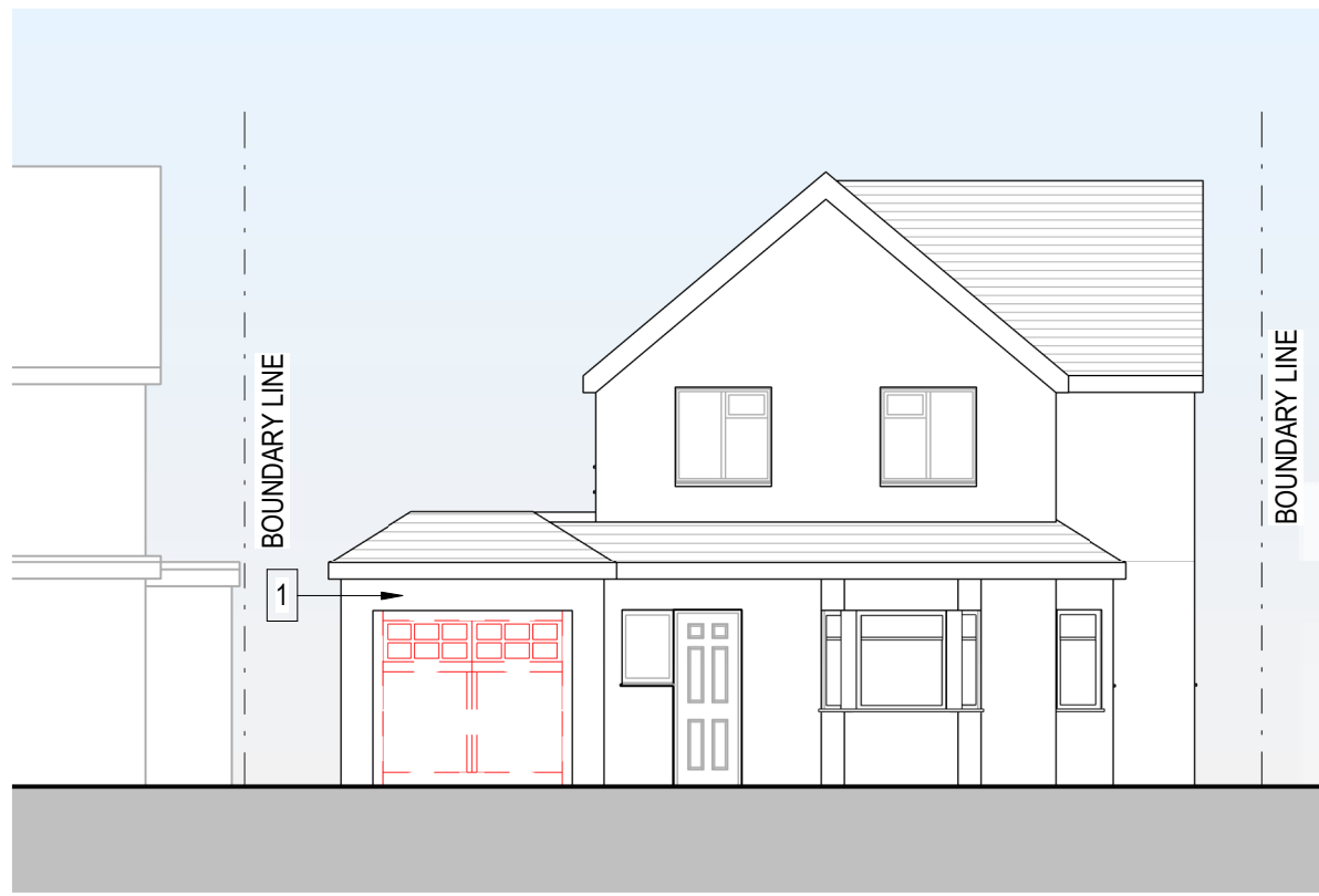
1 Existing Front Elevation 1 : 100