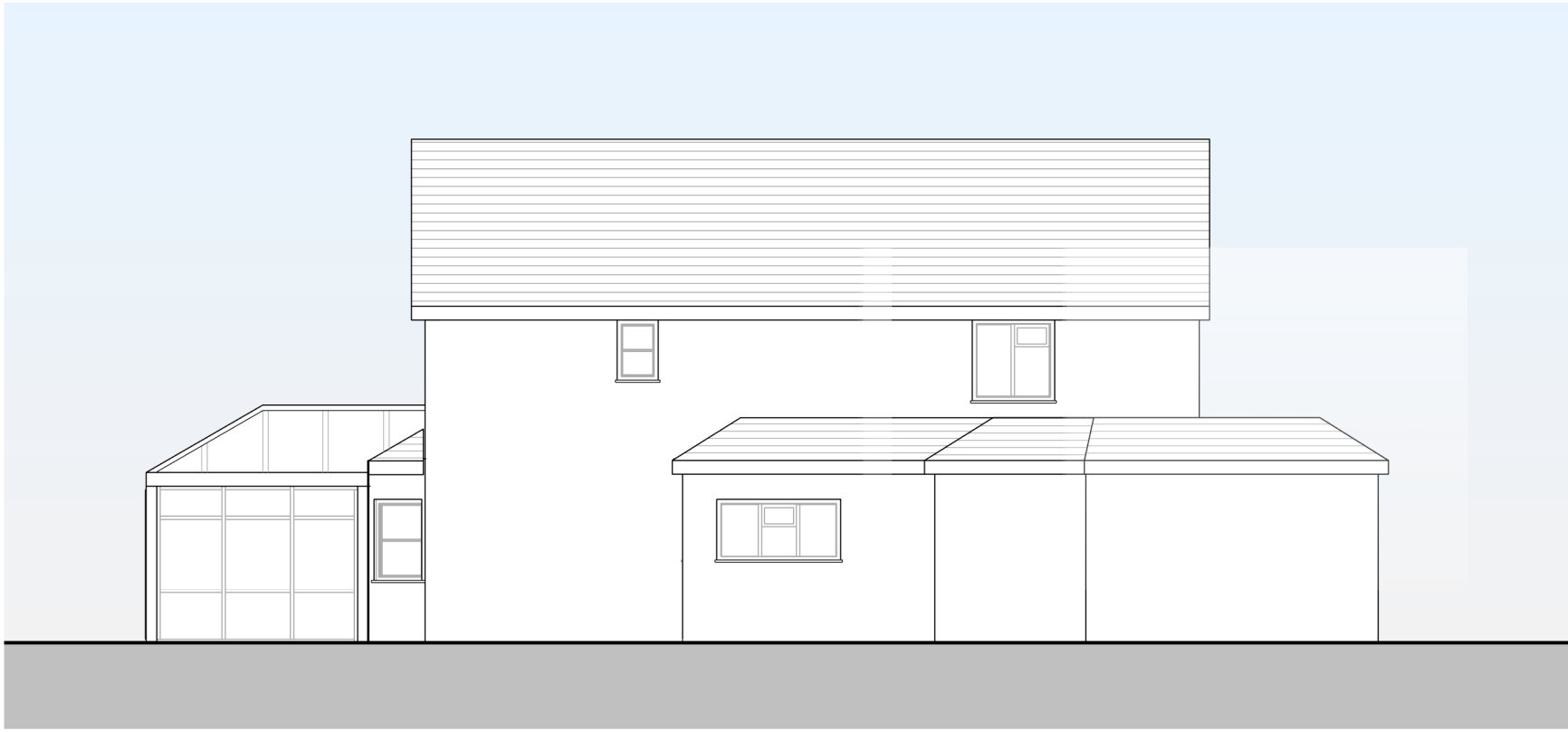
3 Existing Side Elevation 1 : 100