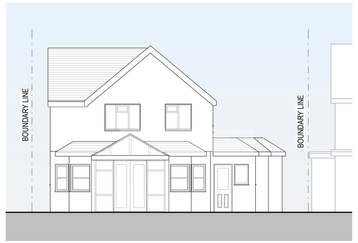
2 Existing Rear Elevation 1 : 100