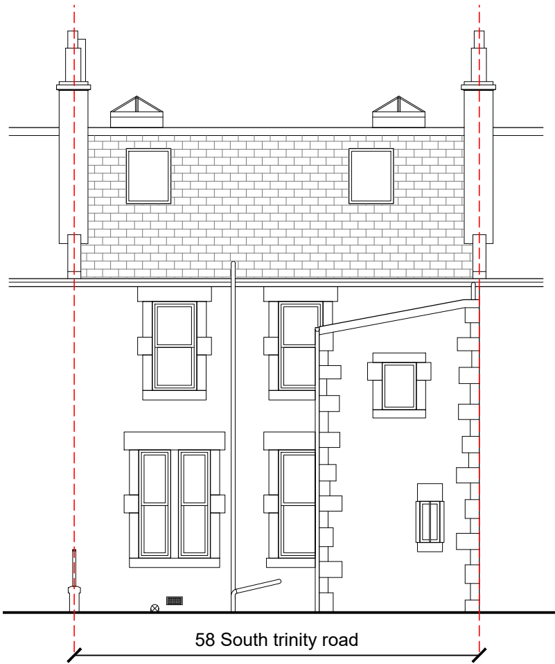
Rear Elevation A