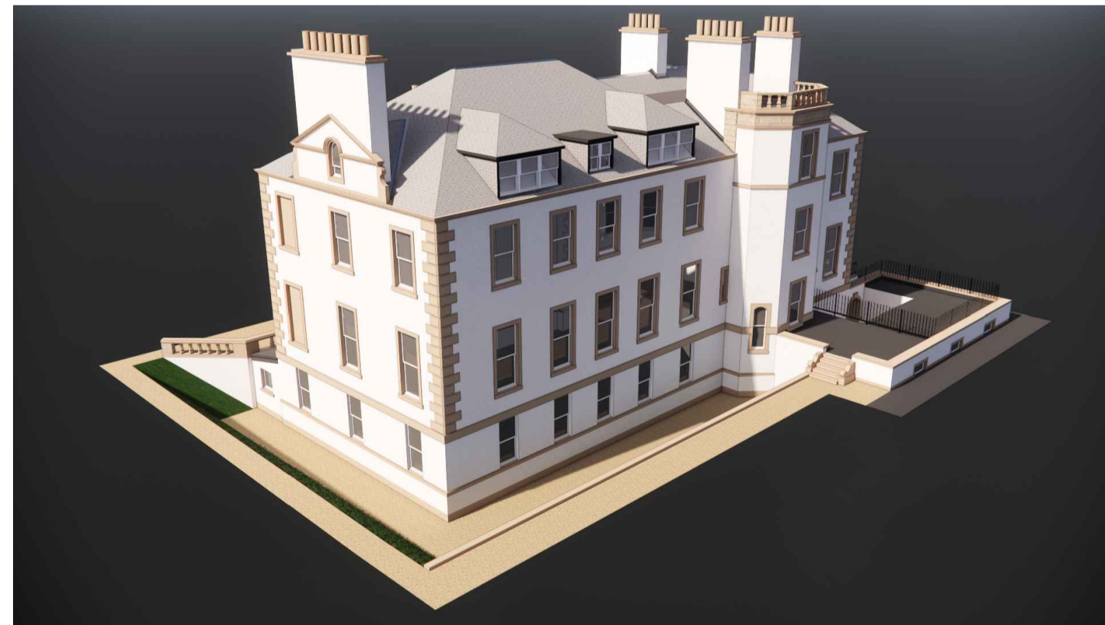
Existing Architectural Illustration 03 | NTS