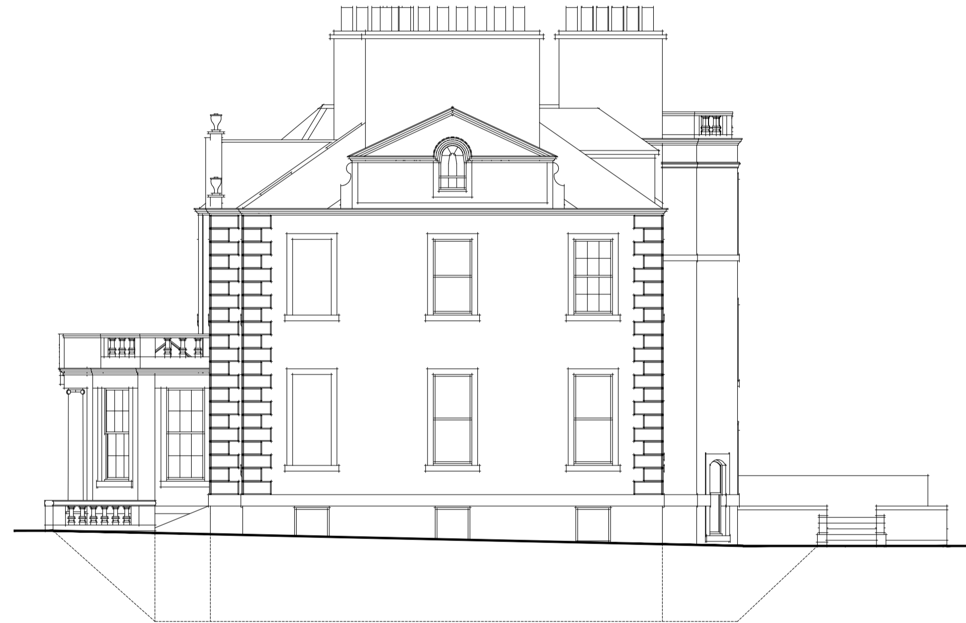
Existing North West Elevation | 1:100