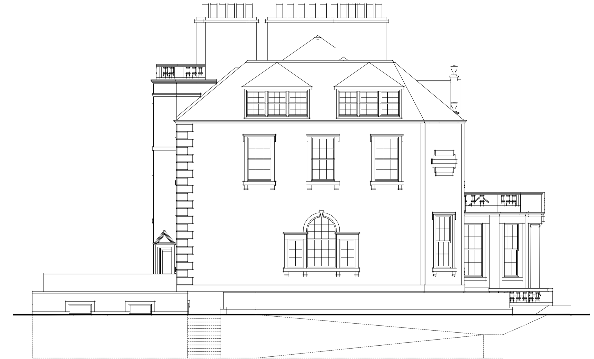
Existing South East Elevation | 1:100