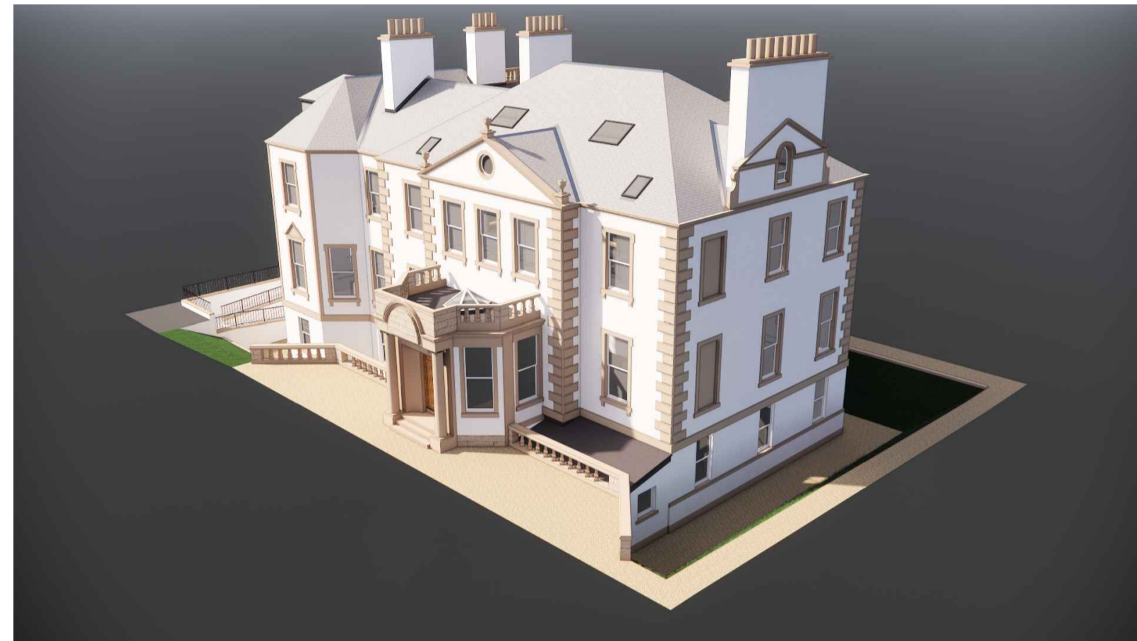
Existing Architectural Illustration 02 | NTS