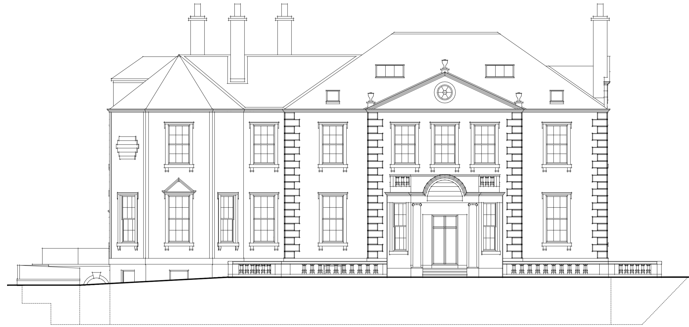
Existing North East Elevation | 1:100