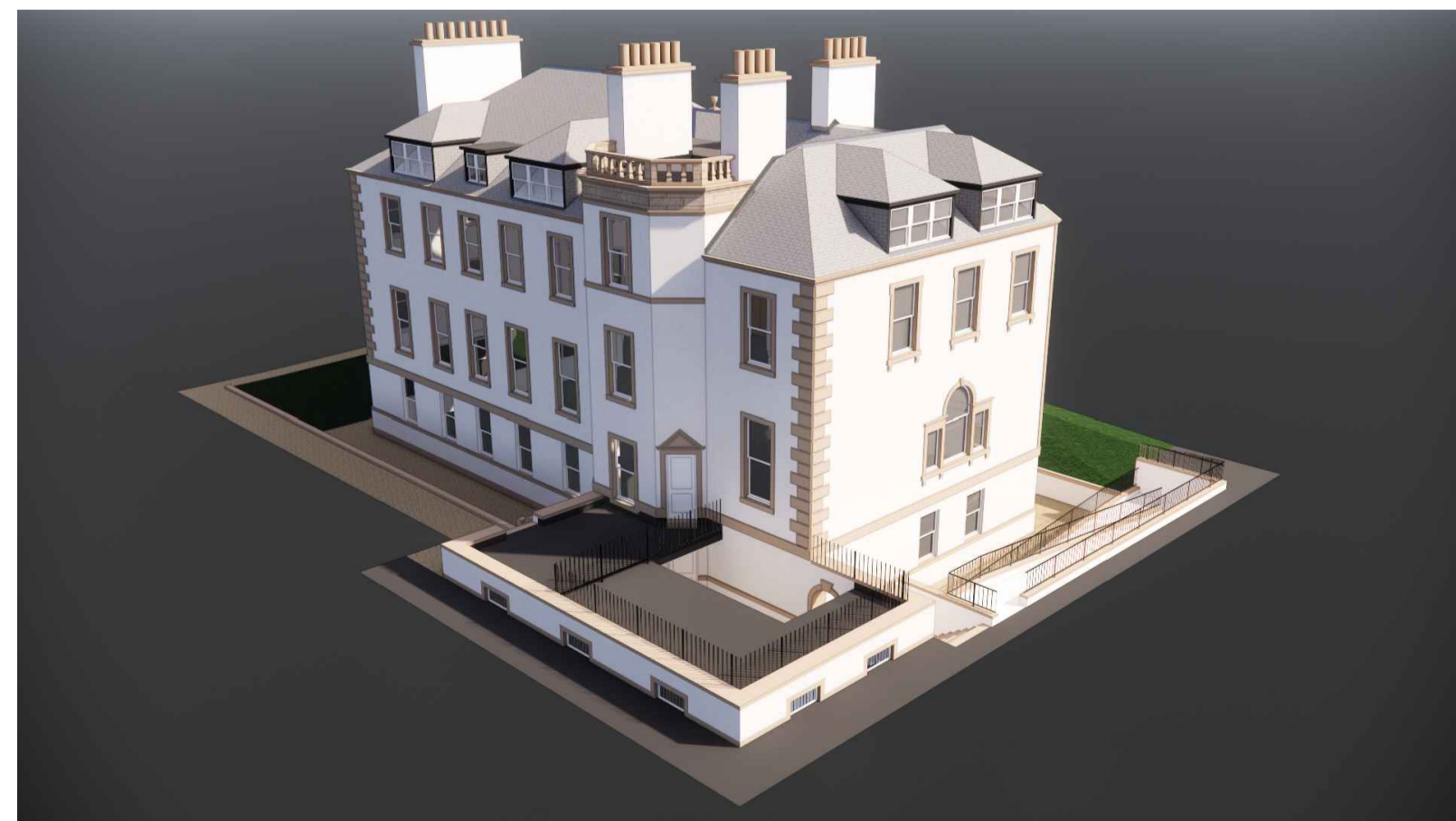
Existing Architectural Illustration 04 | NTS