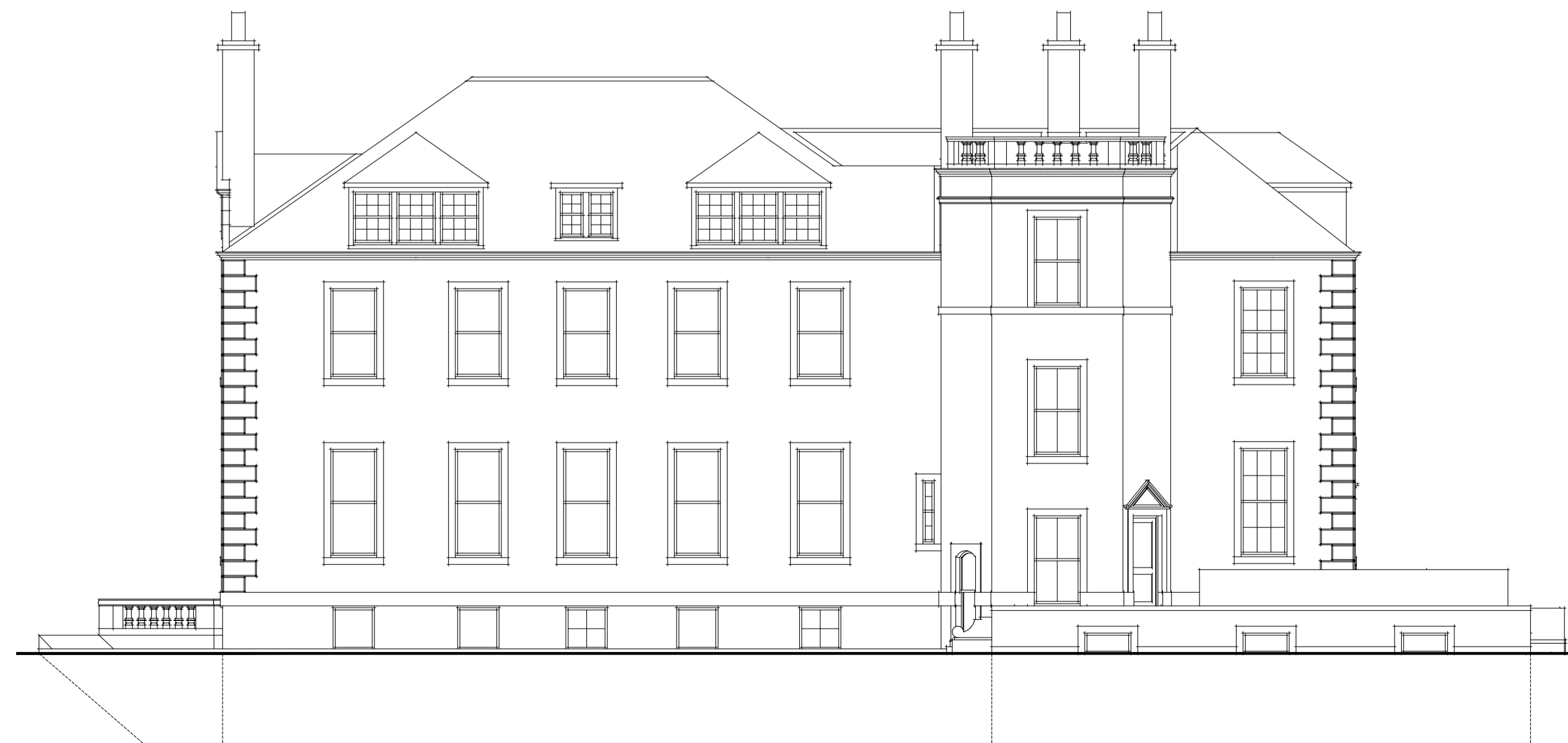
Existing South West Elevation | 1:100