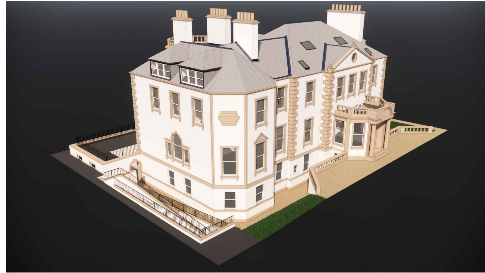
Existing Architectural Illustration 01 | NTS