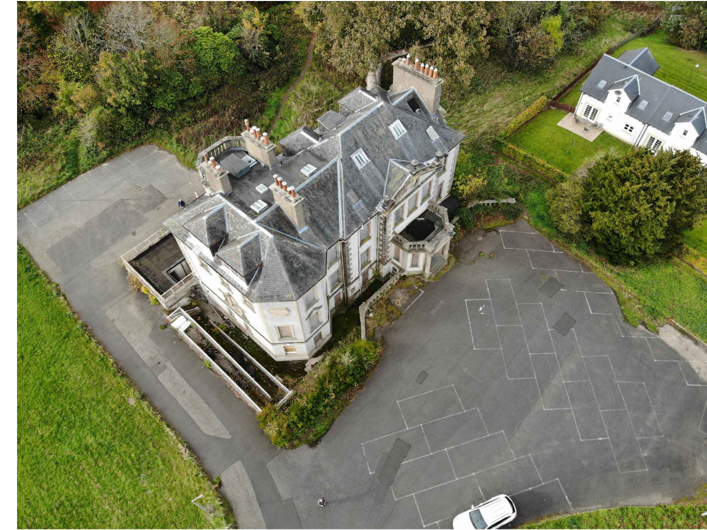
Aerial Photo 01 | NTS