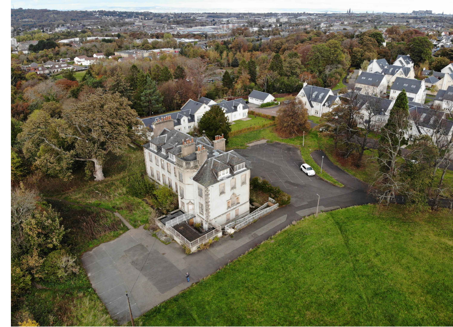
Aerial Photo 02 | NTS