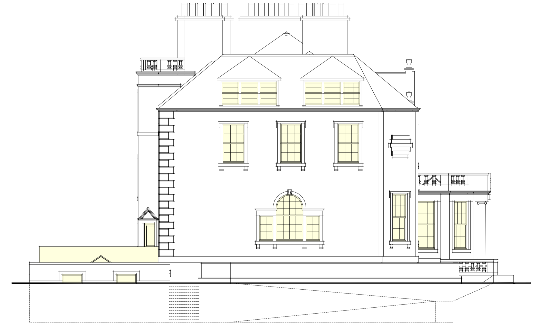
Proposed South East Elevation | 1:100