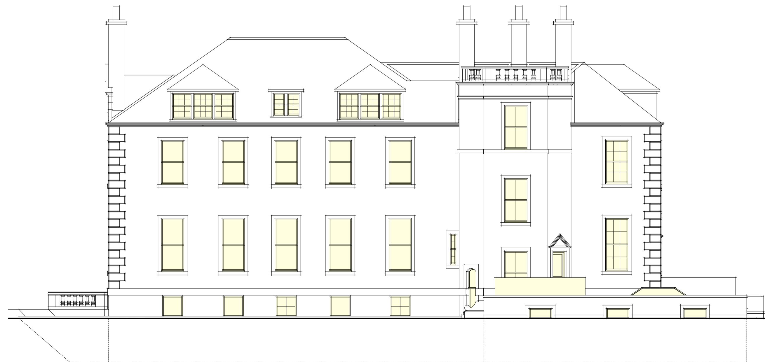
Proposed South West Elevation | 1:100