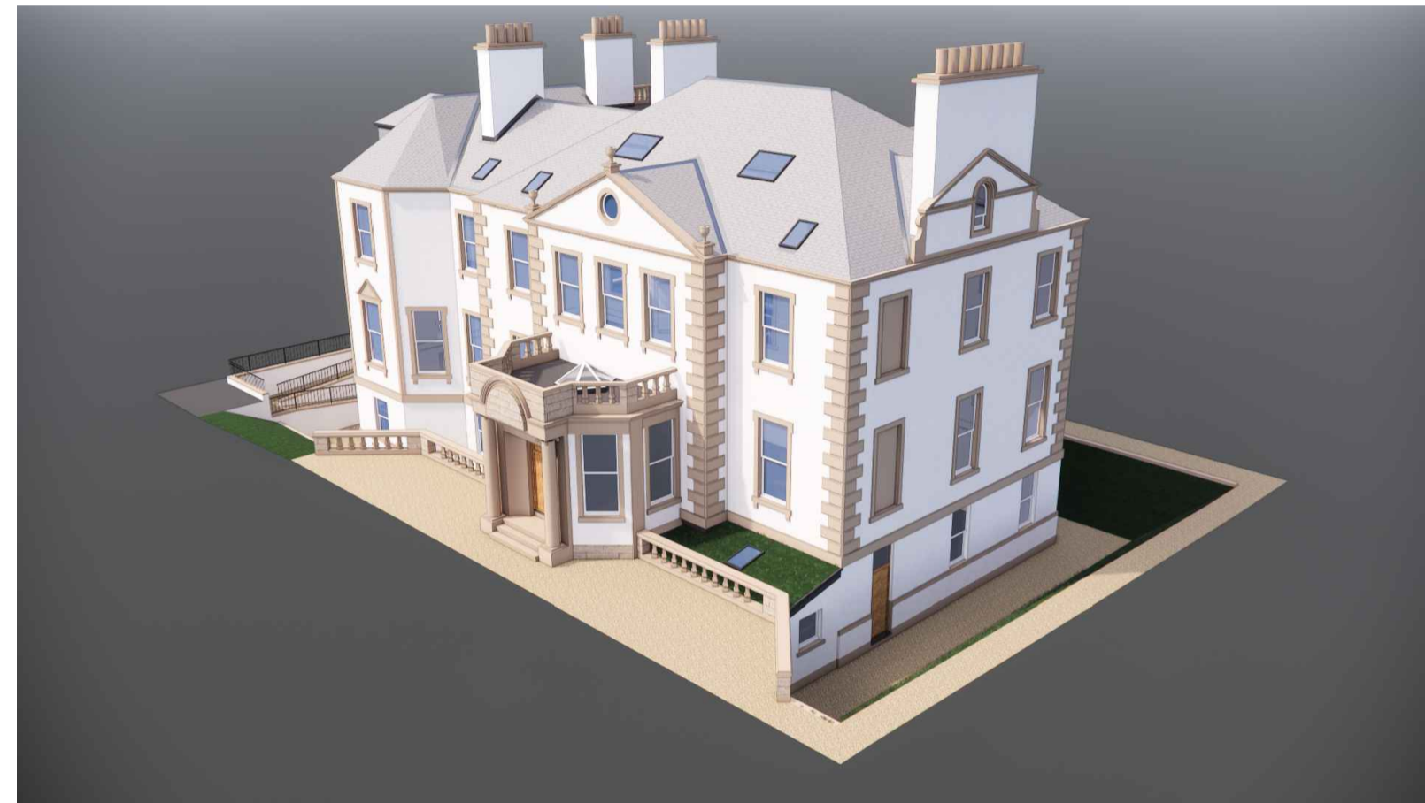
Proposed Architectural Illustration 02 | NTS