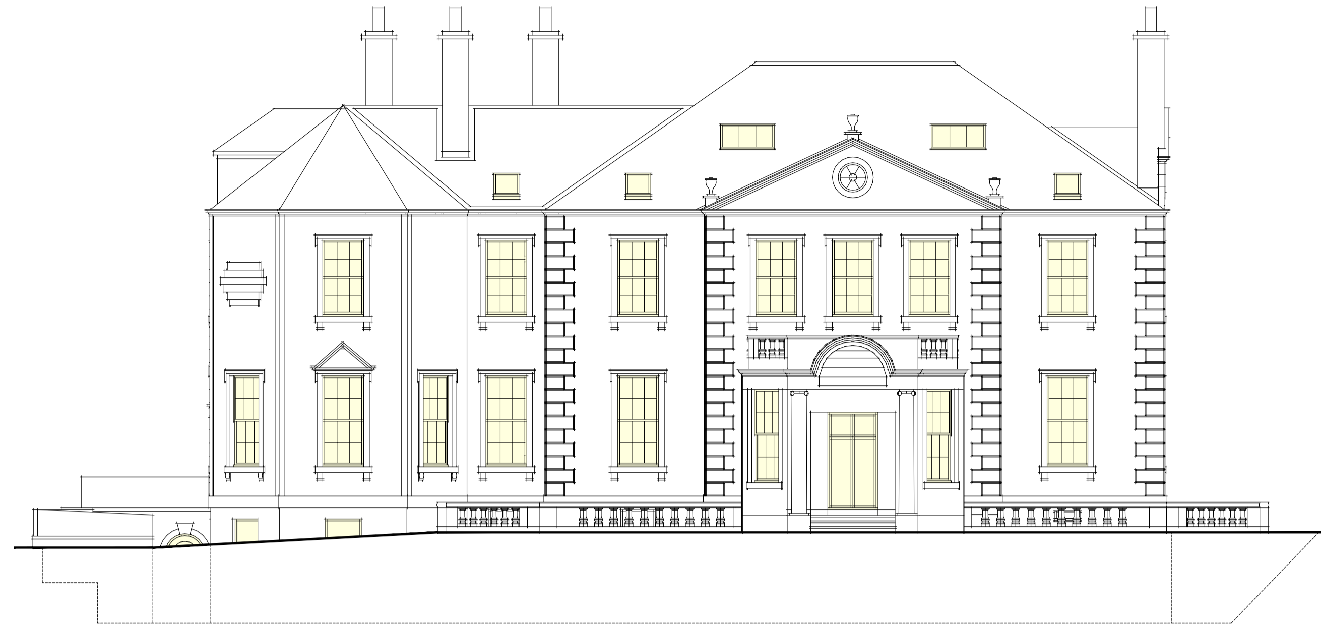
Proposed North East Elevation | 1:100