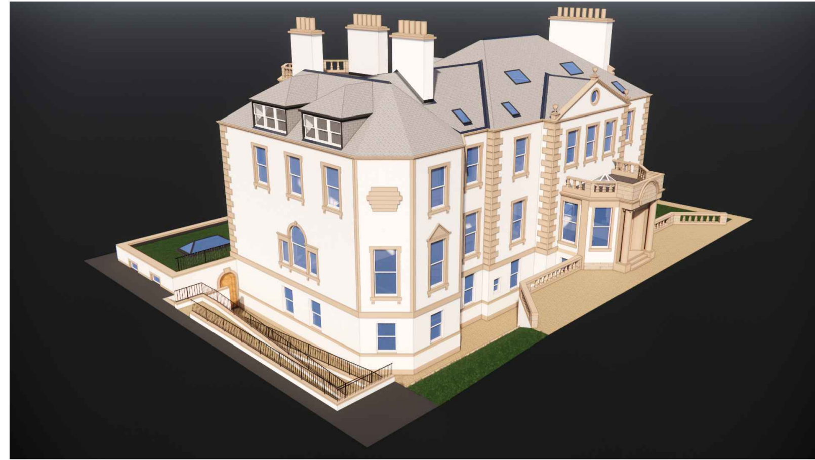
Proposed Architectural Illustration 01 | NTS