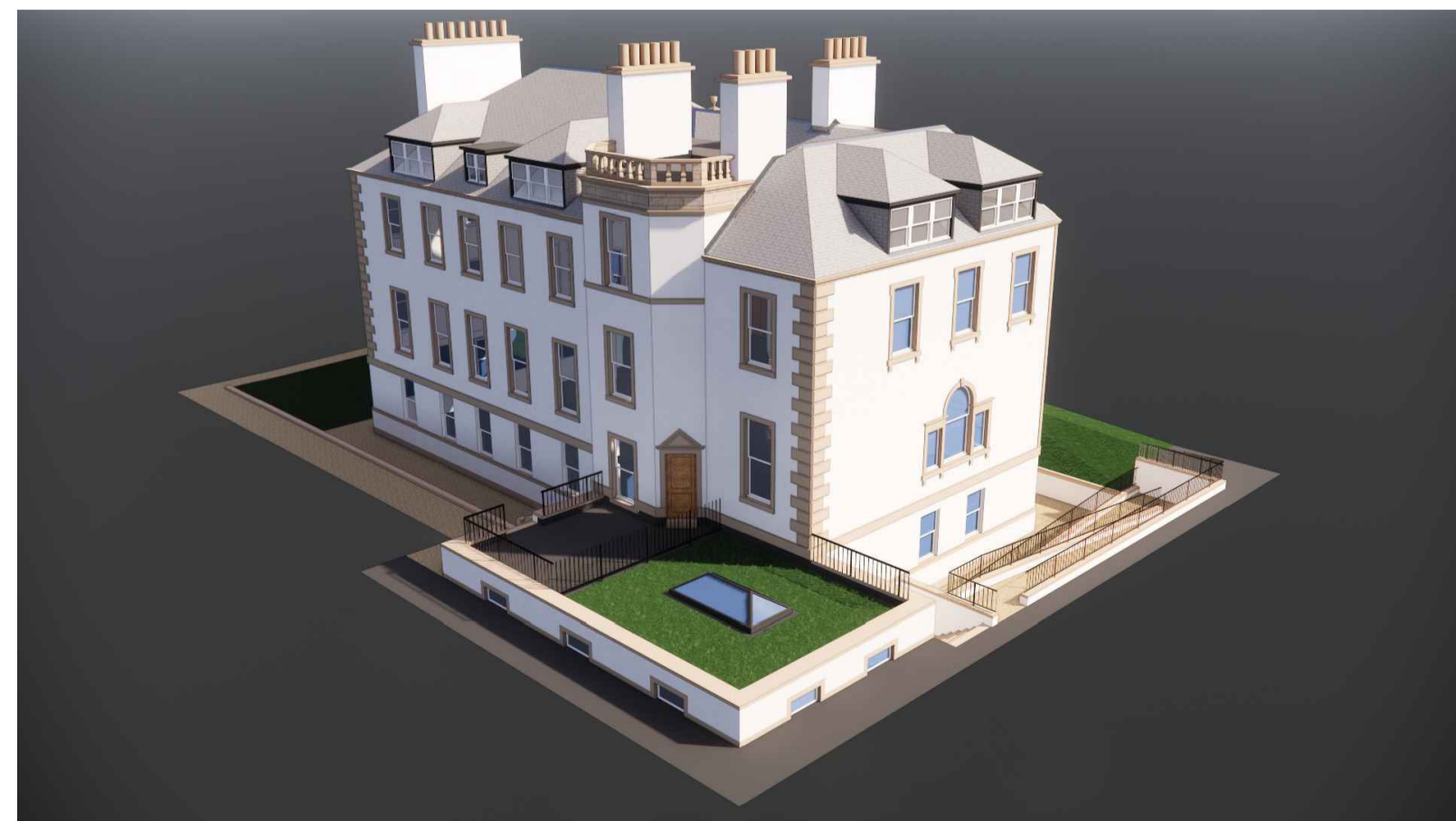
Proposed Architectural Illustration 04 | NTS