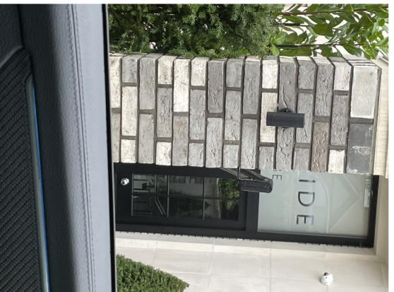
Multi grey facing bricks at The Drive, Radlett