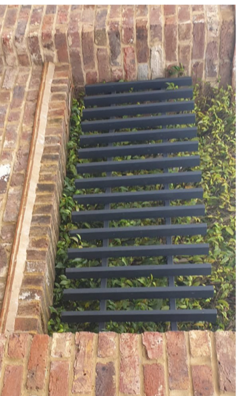
Wrought iron railings and gates at 8 The Warren, Radlett