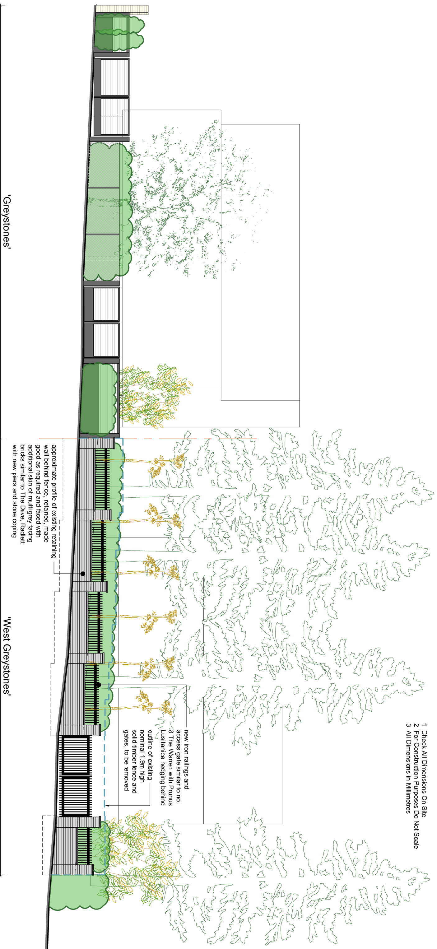
Street Elevation Scale - 1:100