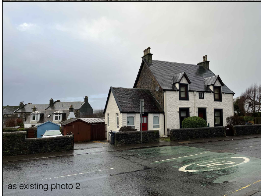
as existing photo 2