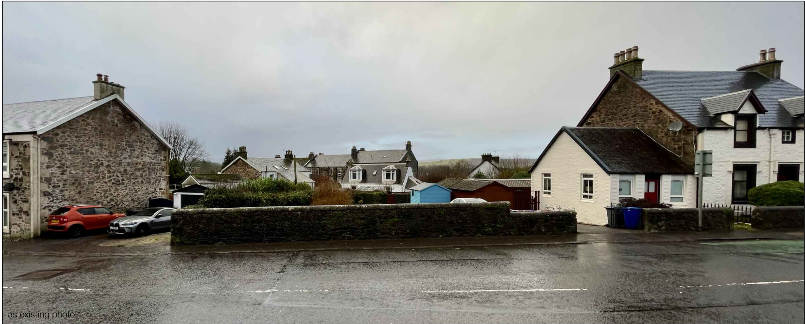
as existing photo 1