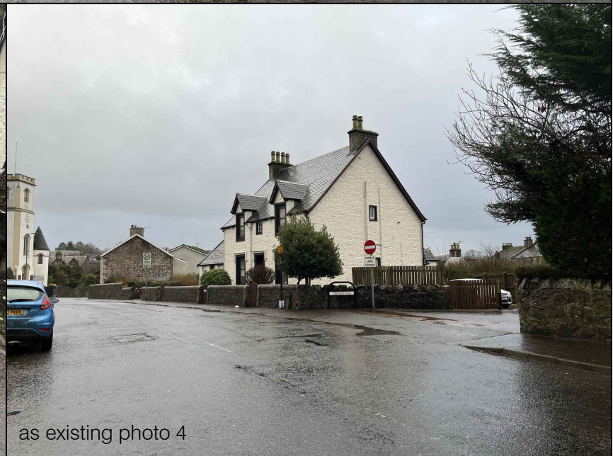
as existing photo 4