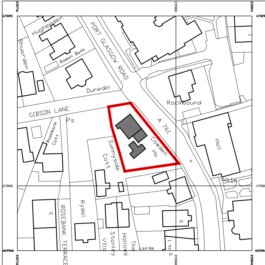
LOCATION PLAN AS EXISTING @ 1:1250