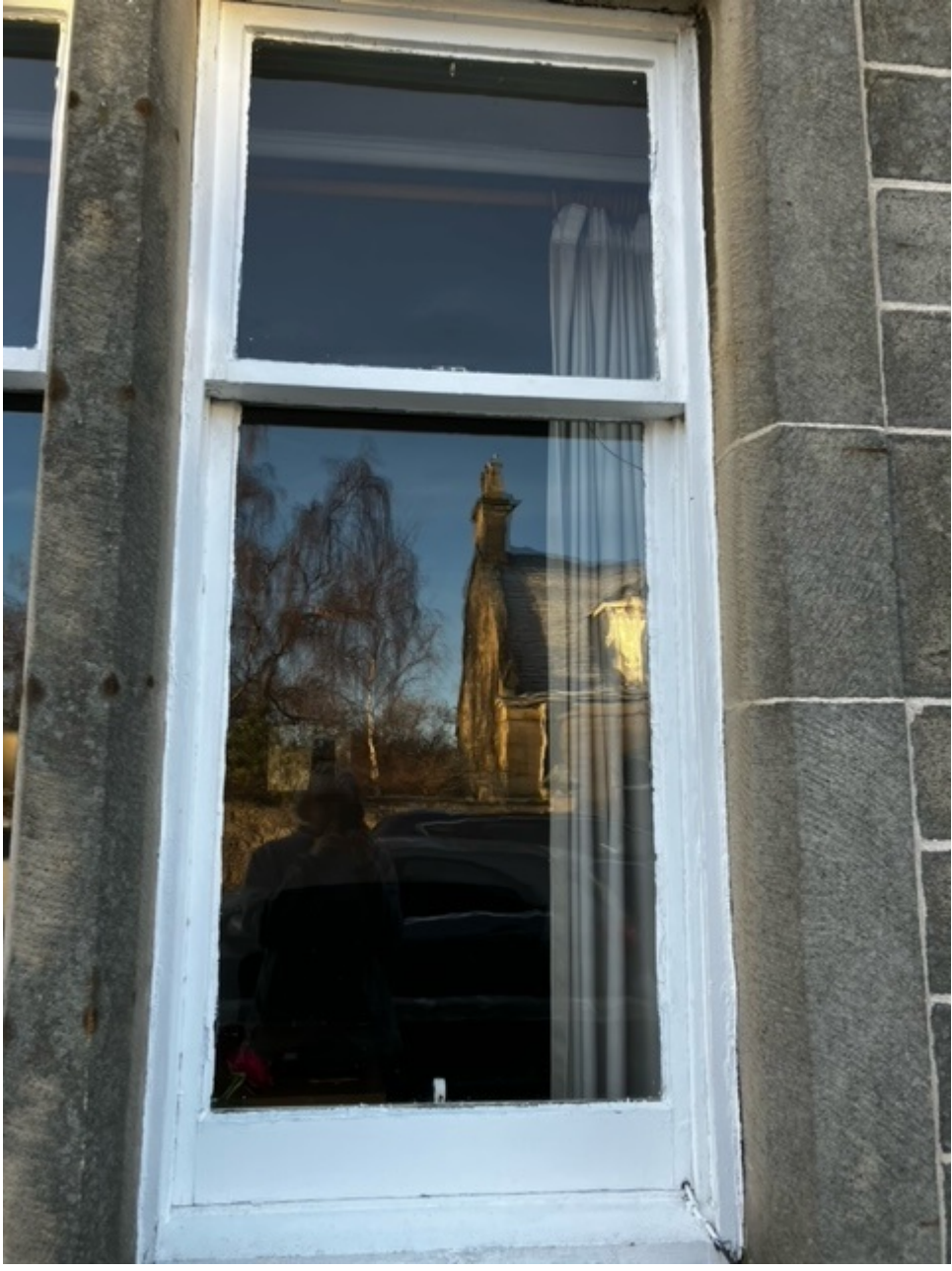
Sent from my iPhone