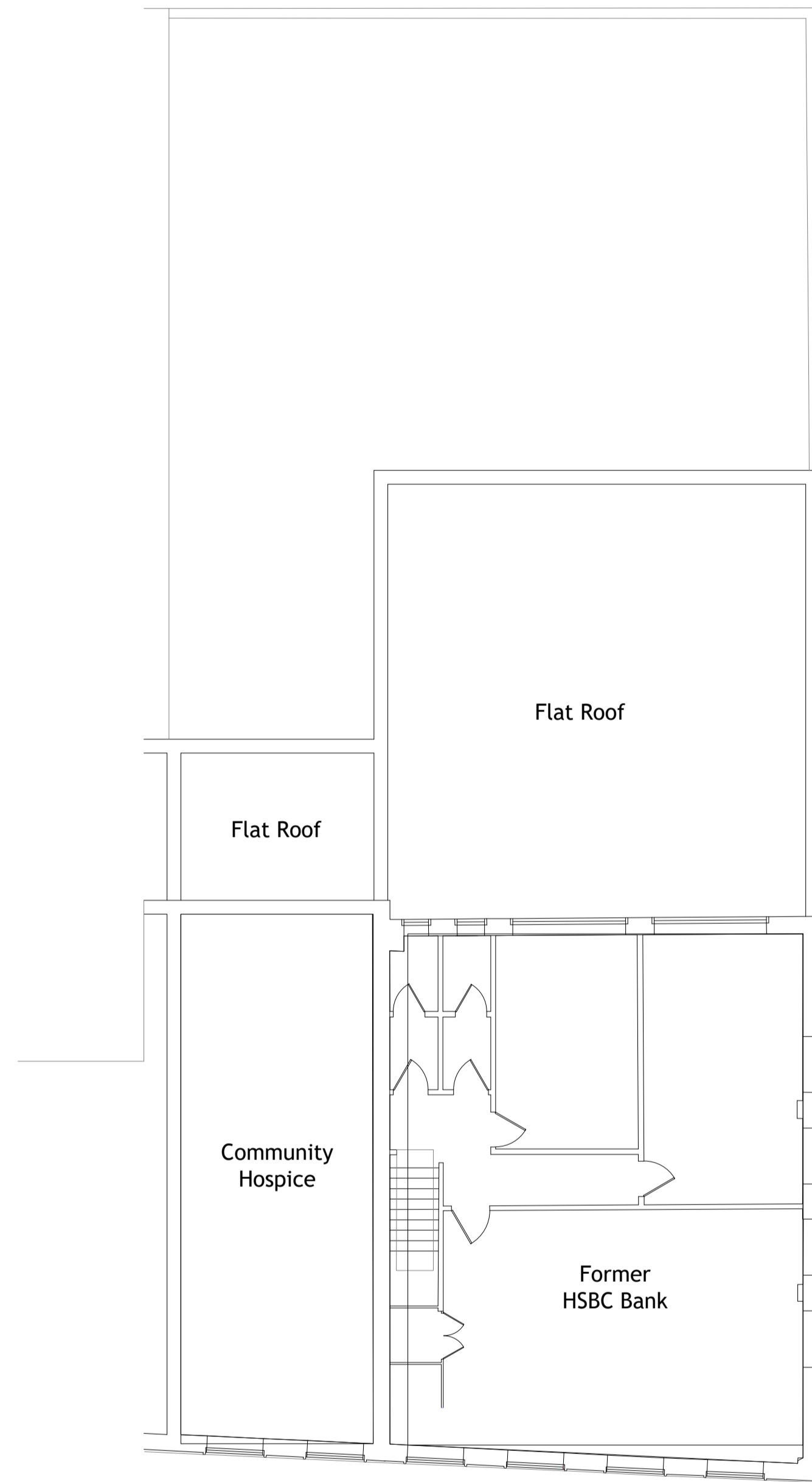
Existing First Floor Plan Scale 1:100 @ A1