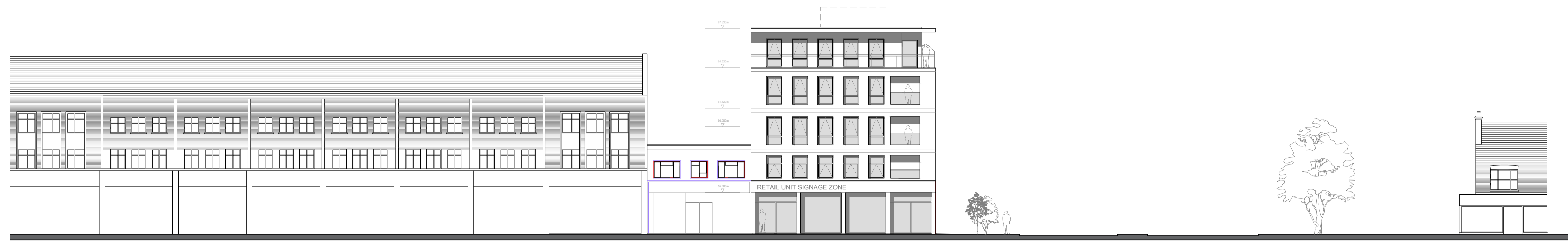
Proposed North Street Scene Scale 1:200 @ A1

NOTES: NO DIMENSIONS TO BE SCALED FROM THE DRAWING TO BE READ IN CONJUNCTION WITH ARCHITECTURAL SPECIFICATION & STRUCTURAL ENGINEER'S INFORMATION ANY DISCREPANCY BETWEEN THIS DRAWING AND OTHER RELEVANT DOCUMENTATION SHOULD BE REFERRED TO THE ARCHITECT FOR DIRECTION KEY SETTING OUT DIMENSIONS TO BE CONFIRMED WITH THE ARCHITECT PRIOR TO ANY DEVELOPMENT ON SITE THIS INFORMATION IS FOR PLANNING OR TENDER PURPOSES ONLY AND NOT FOR CONSTRUCTION