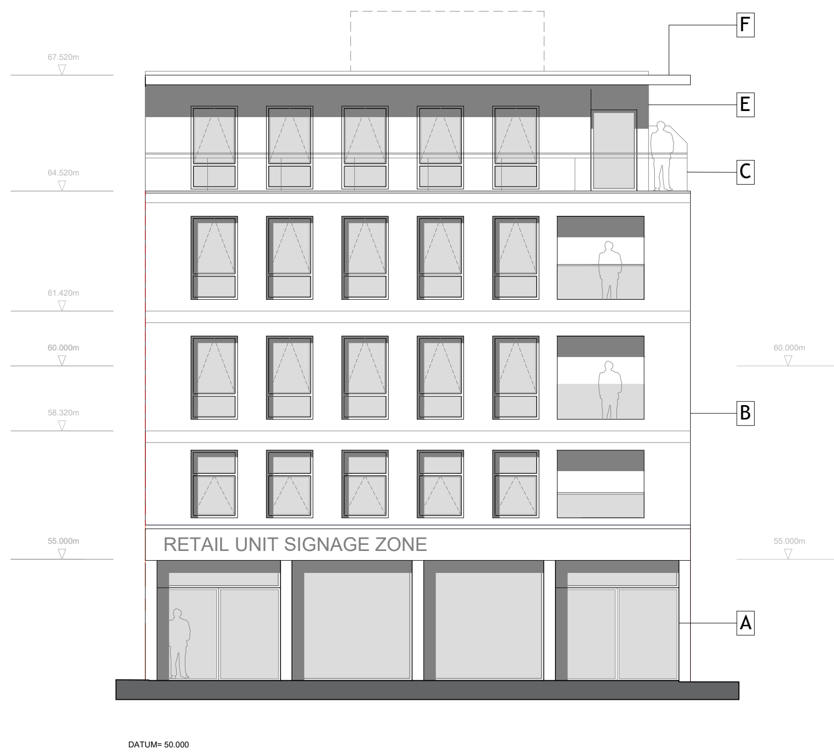
Proposed Front elevation - North Scale 1:100 @ A1