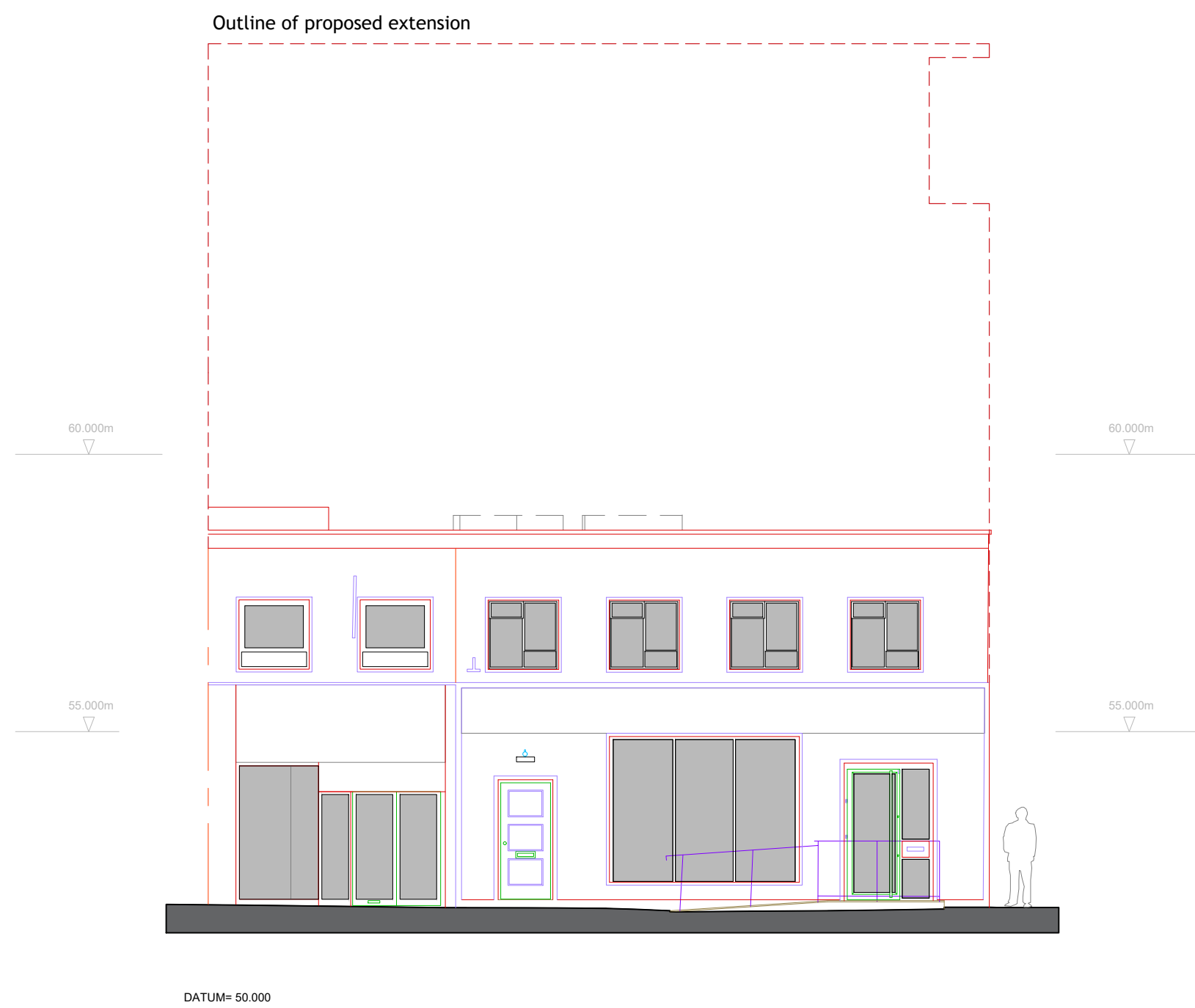
Existing Front elevation - North Scale 1:100 @ A1

NOTES: NO DIMENSIONS TO BE SCALED FROM THE DRAWING TO BE READ IN CONJUNCTION WITH ARCHITECTURAL SPECIFICATION & STRUCTURAL ENGINEER'S INFORMATION ANY DISCREPANCY BETWEEN THIS DRAWING AND OTHER RELEVANT DOCUMENTATION SHOULD BE REFERRED TO THE ARCHITECT FOR DIRECTION KEY SETTING OUT DIMENSIONS TO BE CONFIRMED WITH THE ARCHITECT PRIOR TO ANY DEVELOPMENT ON SITE THIS INFORMATION IS FOR PLANNING OR TENDER PURPOSES ONLY AND NOT FOR CONSTRUCTION