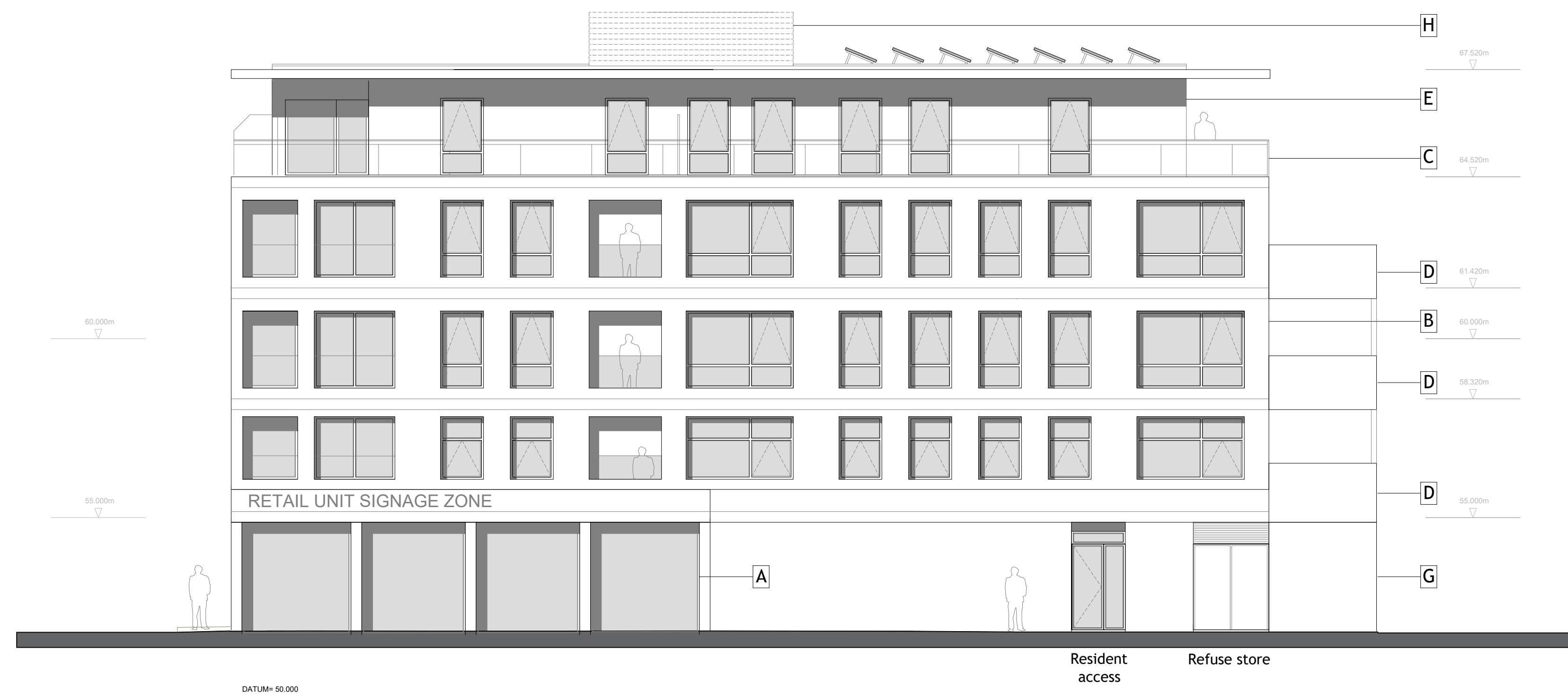
Proposed Side elevation - West Scale 1:100 @ A1

REV B: Additional storey added NEW: Client review only