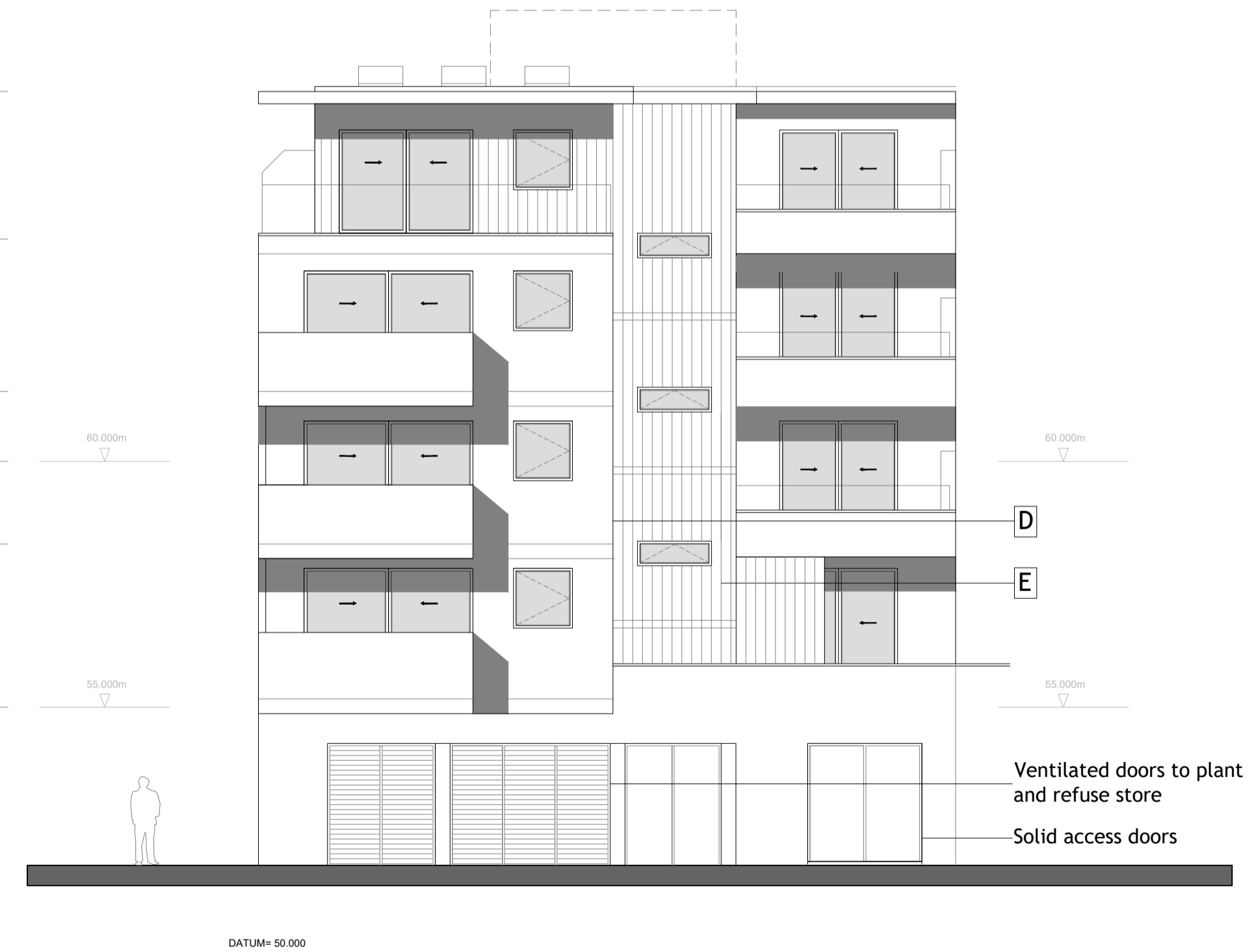
Proposed Rear elevation - South Scale 1:100 @ A1

REV B: Additional storey added NEW: Client review only