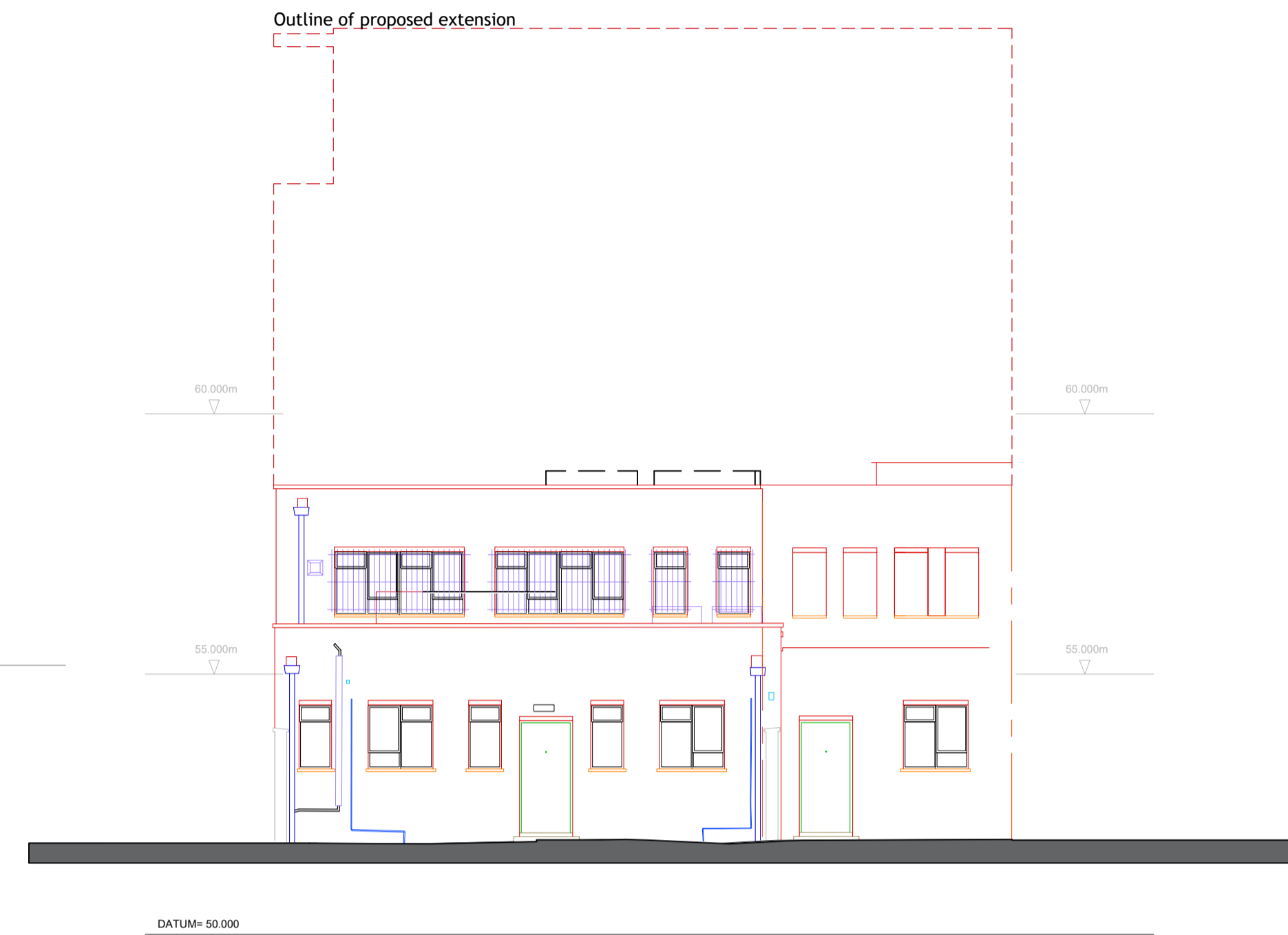
Existing Rear elevation - South Scale 1:100 @ A1