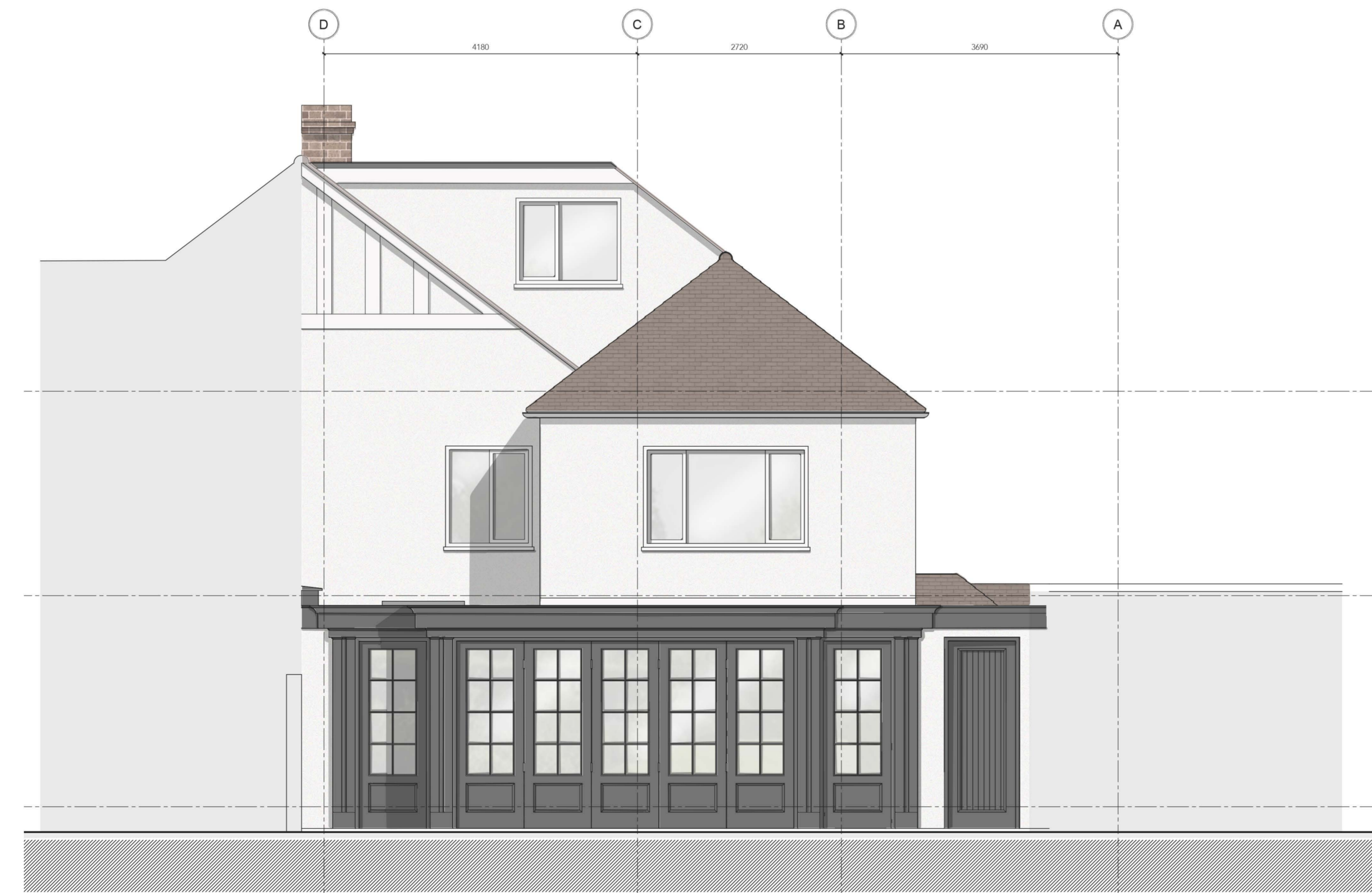
PROPOSED: FRONT ELEVATION 01 Scale 1:50